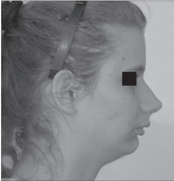
Figure 1. A patient's profile photograph before the treatment