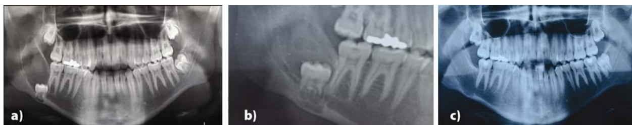
Fig. 1 – Preoperative panoramic radiograph shows a large radiolucent cystic lesion with the impacted third molar located at the base of the mandible [keratocystic odontogenic tumor (KCOT)]; b) Six months after decompression, the impacted third molar was moved to a more suitable position, making extraction much easier. Ongoing bone deposition decreased a defect, making enucleation less traumatic; c) Three years after enucleation, panoramic radiograph shows a complete healing of the former bone defect, without any suspicious sign of a recurrence.

oth in the cystic lumen (Figures 1a and b). It was the third molar that was impacted most often (83.33%) and all of them were extracted during enucleation (Figure 1c); 10 (77.77%) dentigerous cysts were associated with premolars – 8 (66.66%) mandibular and 2 (11.11%) maxillary. A total of 4 (22.22%) maxillary dentigerous cysts were associated with the canine. Just in one (7.14%) case the affected tooth was extracted, while in 13 (92.86%) patients the affected teeth were saved; of these, 12 (85.72%) teeth erupted spontaneously and 1 (7.14%) needed orthodontic traction (Figure 2a-c). Figure 3 shows the rough surface of active bone deposition favored by decompression in one patient.