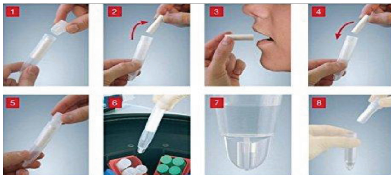
Figure 1. Saliva sampling using special tubes (Salivette®) Slika 1. Uzimanje pljuvačke pomoću salivete

range from 6.1 to 7.8 [7]. Buffer capacity (BC) of saliva depends on the flow of saliva, therefore phosphate buffer is primary buffer in unstimulated saliva, which gives it slightly acidic character (pH about 6.1), while the main buffer in stimulated saliva is bicarbonate buffer, which makes it slightly alkaline (pH about 7.8).