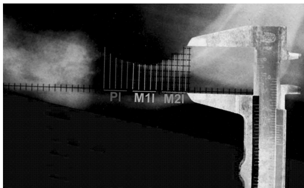
Figure 1. Segments of interest in mandible