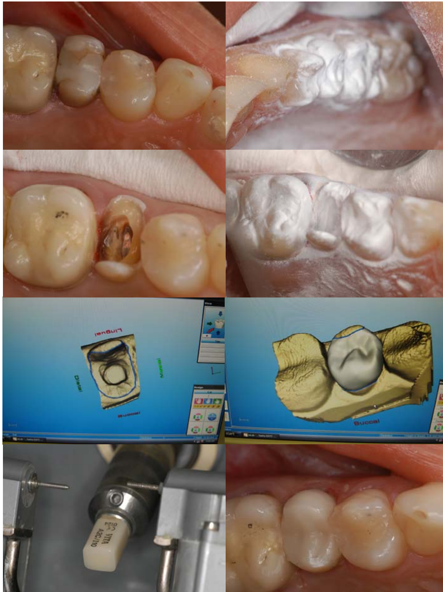
Slika 3. Jednoseansna izrada endokrone na zubu 25 CEREC® metodom: a) početno stanje, b) priprema za primarno skeniranje prahom titanoksida, c) preparacija korenskog dela, d) priprema za skeniranje preparisanog zuba, e) skeniran preparisan zub, f) virtuelni dizajn endokrone, g) keramički blok iz koga će se izfrezovati endokruna, h) završena obrada endokrone metodom poliranja.

Figure 3. Chair-side production of the endo-crown on tooth 25 using the CEREC method> a) initial phase b) preparation for primary scanning with titanium-oxide powder c) root canal preparation d) preparation for scanning of the prepared tooth e) scanned and prepared tooth f) virtual design of the endo-crown g) ceramic block for milling the endo-crown h) final restoration after polishing.