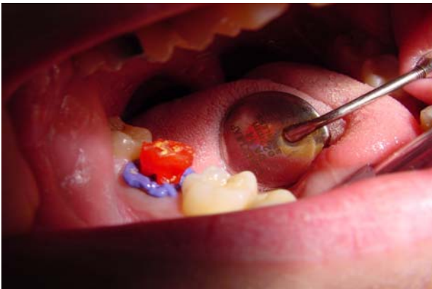
Slika 6. Uzimanje otiska za endokrunu