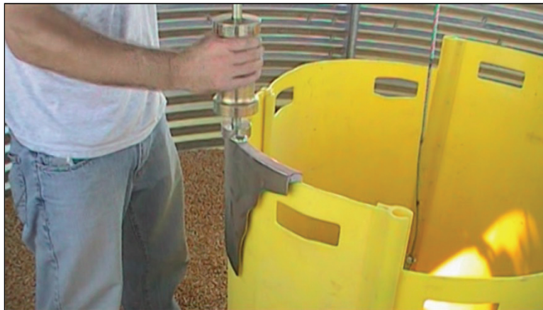
Figure 4. Grain rescue tube panels being driven further into the grain mass with the panel driver.