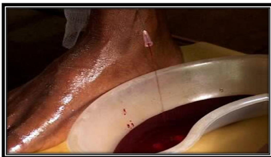
Figure 4: Procedure Showing Siravyadha