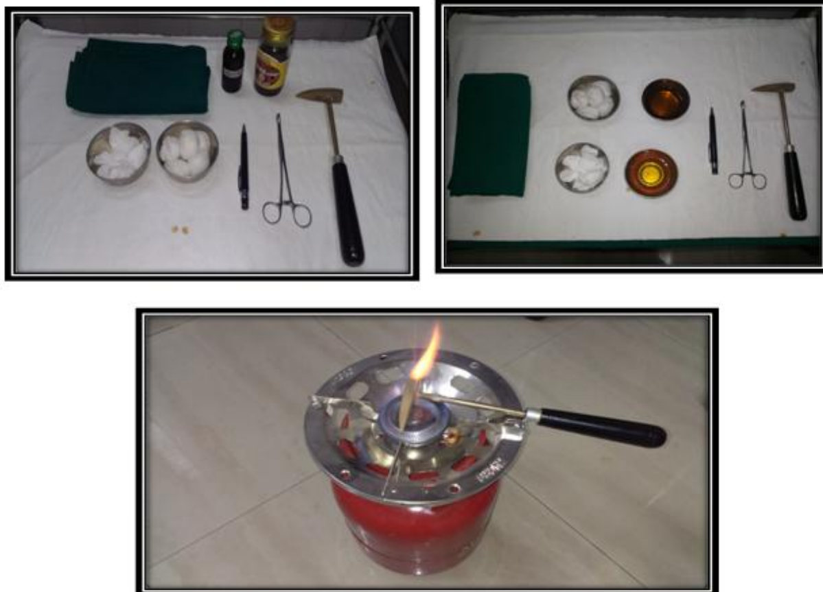
Figure 1: Instruments used for Agnikarma