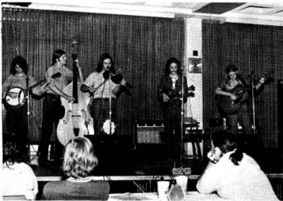
Front Porch String Band

The group itself was very pleased with the enormous outcome and it had been