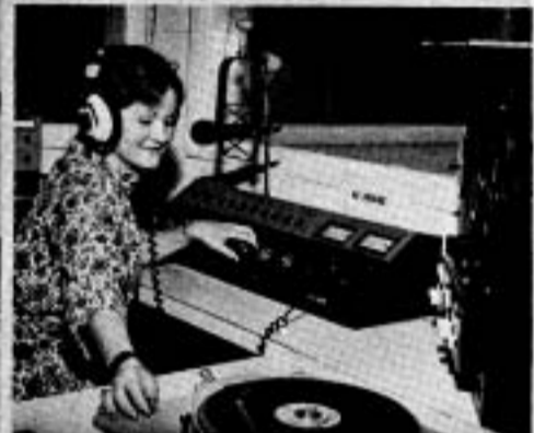
WLJS will be operated by JSU students on a volunteer basis.