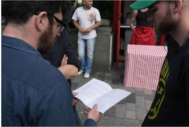
Figure 11: How far would you walk to find clean drinking water? – Reading the script of the experiment.