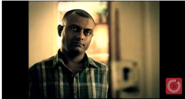
Figure 6: "Ring the Bell" – Neighbor.