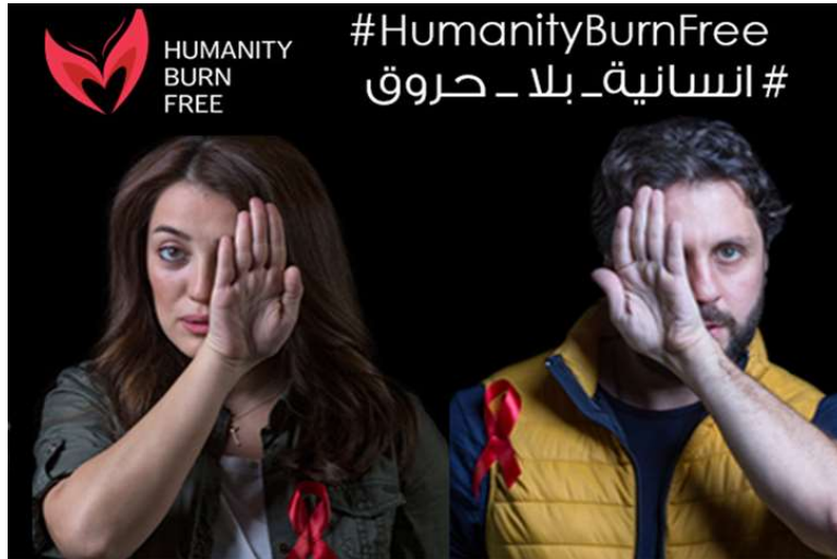
Figure 15: Syrian Actress Kinda Alloush with Egyptian actor Hisham Maged.