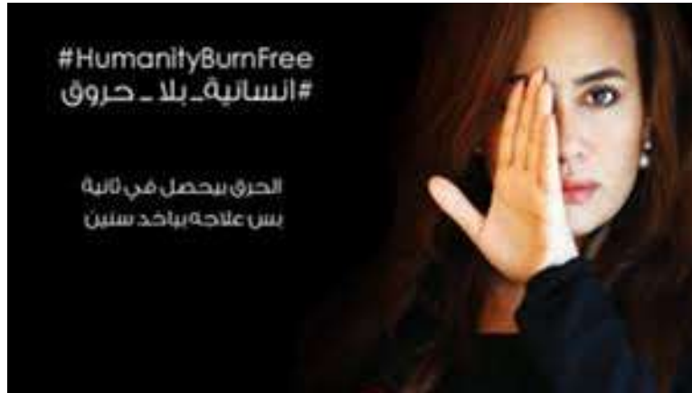
Figure 17: Humanity Burn Free - Actress Hind Sabry - Burns happen in a second, but take years to heal.