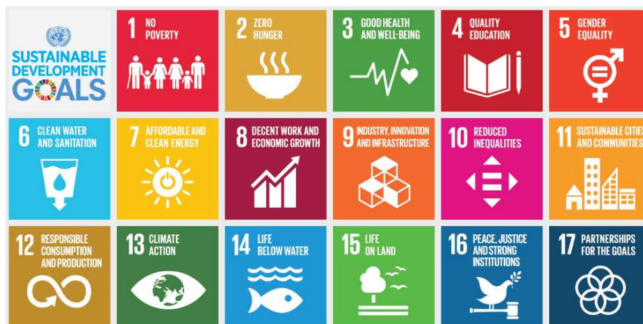
Figure 1: Sustainable development Goals (SDGs).