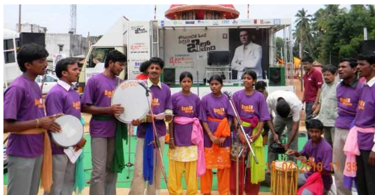
Figure 9:2 Mobile Video Van with Art Show.

As for the below the line activities, the campaign included mobile video vans that traveled 14,000 miles in 2010 alone to tour the villages broadcasting the different PSAs allowing youth advocates to have a direct contact with people and encourage them to be involved and participate in the campaign through games, theater, puppetry, dance and quizzes. In addition, a public relations (PR) campaign also took place where a small PR agency pitched editorials about violence against women and the campaign to different local and national media outlets.