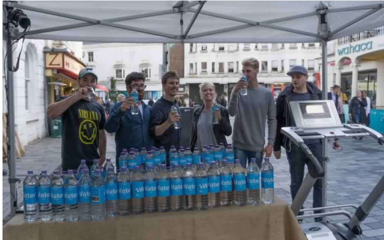
Figure 12: How far would you walk to find clean drinking water? – The finalists of the social experiment with the water stall.