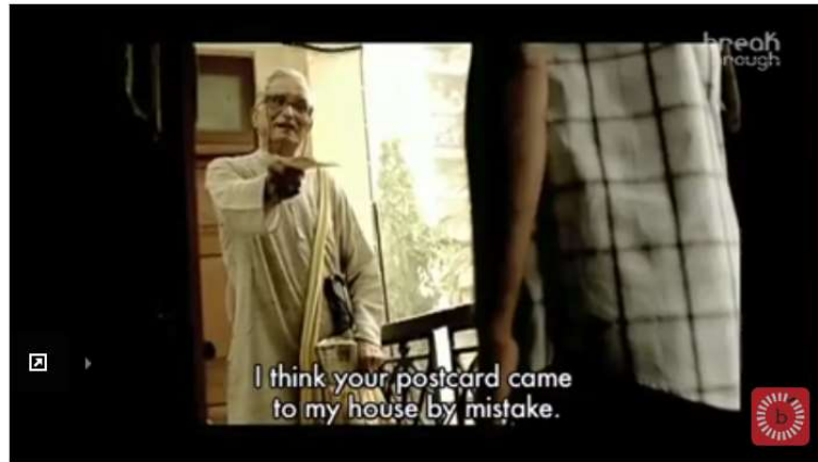
Figure 4: "Ring the Bell" -Bank Clerk.