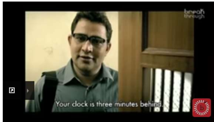
Figure 3: "Ring the Bell" - Software Engineer.