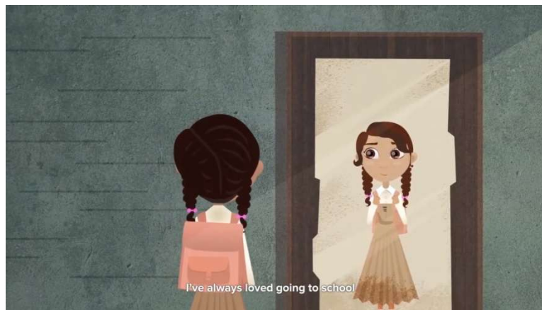
Figure 18: "Her future is in Education" - Menna, 14, the main character of Benefits of Girls' Education video.

The video tells the story of Menna who is turning 14 and how she loves her school, yet, her father Awad has surprised her with a much unexpected gift for her birthday, a groom. It shows her struggle to convince her father that she is still young and that she would like to finish her studies, yet, her father insists. Just when she gave up, she found that her father has changed his mind as he heard that his niece, who is 14 as well, has gotten very sick following giving birth. Menna becomes a lawyer, a wife, and a mother at the end of the video.