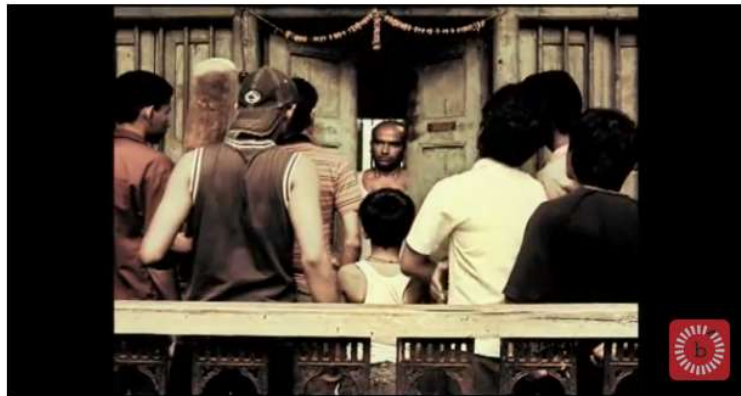
Figure 7: "Ring the Bell" - Boys playing Cricket.