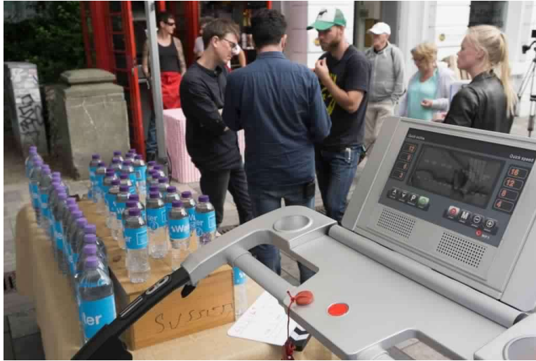
Figure 10: How far would you walk to find clean drinking water? – Preparations of shooting the social experiment.

Only a handful of participants were willing to finish the challenge and walk on the treadmill to get the water bottle. The distances they walked were only a percentage of what Somali children would walk (UNICEF, 2017).