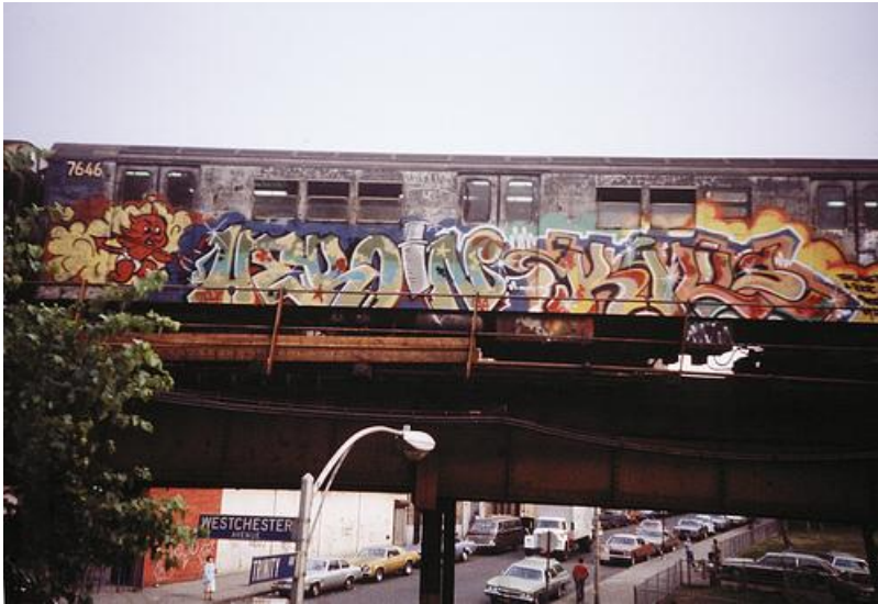
Figure 3 247