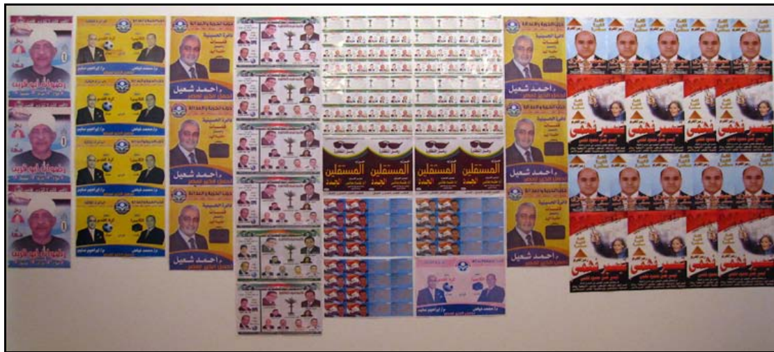
FIGURE 2: POLITICS OF REPRESENTATION

and remade as “art.” Townhouse called for the exhibit to “function as a tangible witness to the construction of this key moment in Egypt’s history, and assemble an archive of political ephemera.” But Townhouse was not only serving to “witness” these events but also to participate in a project of “museumification,” writing these elections into collective memory as “a key moment in Egypt’s history.” Moreover, it was a project of collection, a desire to bring together and catalogue items as meaningful and worthy of preservation.