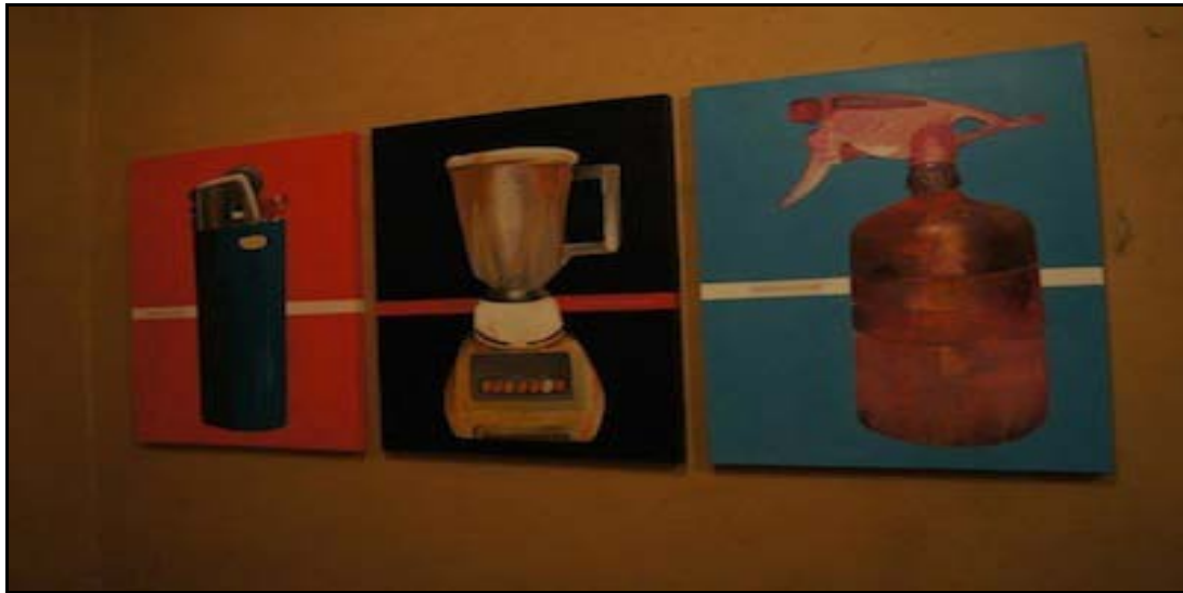
FIGURE 3: ACCUSATIVE CASE BY AHMED SHAWKY

burning of incriminating evidence in the Ministry of Interior, not long after the 18 days. The blender is a slightly less obvious symbol but is reminiscent of the confusion and chaos that have dominated the discourse in Egypt in the past year.