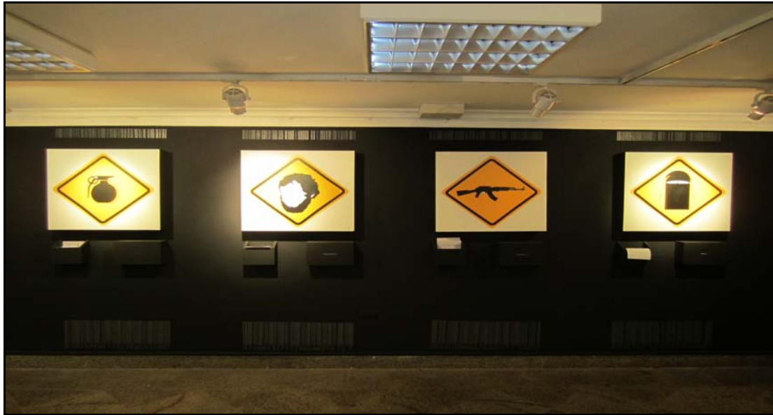
FIGURE 6: FIND DEFINITION BY AMR AMER

Under each image, there was a box full of blank papers that read “Find Definition” at the top with a reprinted picture of the image. The expectation was that visitors to the gallery would fill out their definitions of each image and put them in the collection boxes below. One can assume that Amer chose these different symbols for their relevance to the current moment as his project aspires to reclaim these objects and their assumed associations through definition. While the project assumed power and understanding come through definition and recognition, it also encouraged these images to be redefined along the lines of a familiar language. In the following section, I will work through these images and the space using the analytic work of Patricia Hayes (2005) and Chris Pinney (2006).