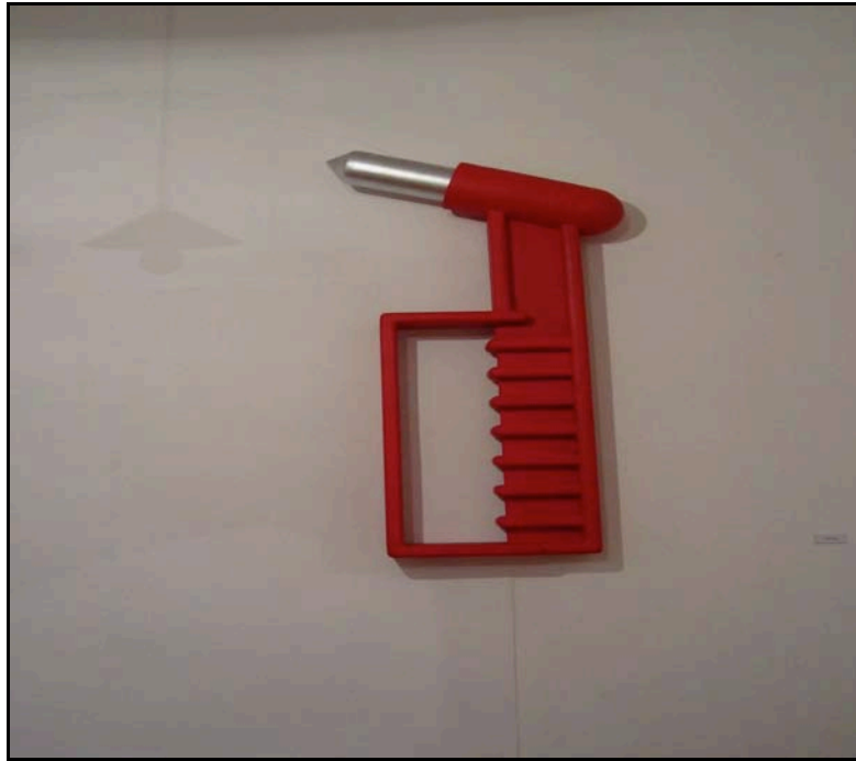
FIGURE 4: LIFE HAMMER BY AHMED BADRY

Cairo Documenta II , for all its claims of distinction from the private gallery space, was similar in form and experience to many of the other gallery shows in downtown Cairo. The containment or enframing of the “white cube” that they so desperately sought to avoid or counteract, was its reality. This containment can be seen in its “documenting” project, its claims to memorialize, its white walls and empty rooms and the artworks that fail to move beyond the imagery and symbolism of “revolution.” In the following section, I will look at another exhibition, which opened the same month, in the Saad Zaghloul cultural center, titled Shift Delete 30 .