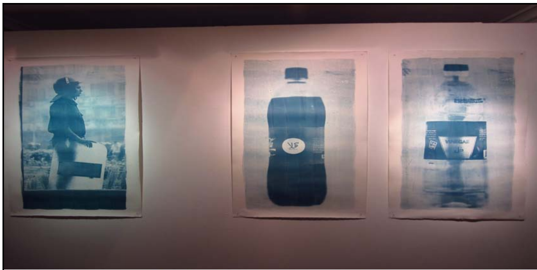
FIGURE 5: VINEGAR...SOLIDER...COKE BY MOHAMED EZZ

revealed, on second glance, an alternative to where the ingredients usually go. The Coca Cola bottle read “Cola helps in diminishing the effects of the gas on the face and its impact on the skin” while the vinegar bottle read, “use after inhaling gas to eliminate suffocation.” Both alluded to the alternate uses of these ordinary household liquids in the protests.