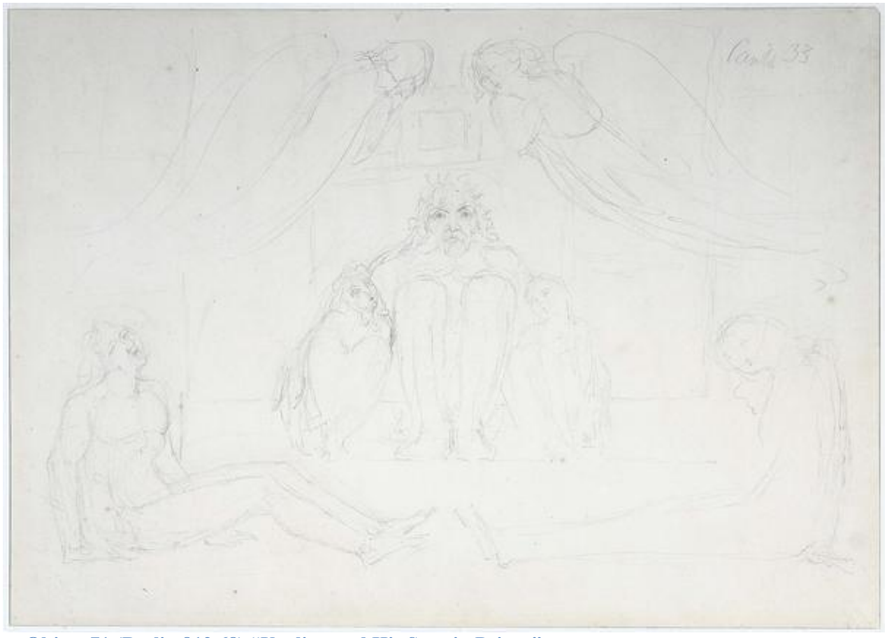
Object 71 (Butlin 812.68) "Ugolino and His Sons in Prison"

Plate 71 is an incomplete plate that shows etchings of what would have been Count Ugolino and his sons in prison, corresponding to Dante's Inferno , canto XXXIII. The setting for this depiction is the prison where Count Ugolino and his sons were imprisoned. The Count is sitting in the middle, looking grim and embracing two children, while on each side of the illustration another one of his children is sitting on the ground. All of the people present seem to be in despair, except for Count Ugolino, who gives the impression of having been "turned to stone", as he himself suggests in the canto (49). He reveals no trace of emotion but stares at his audience impassively. The incompleteness of the illustration leaves little room for analysis.