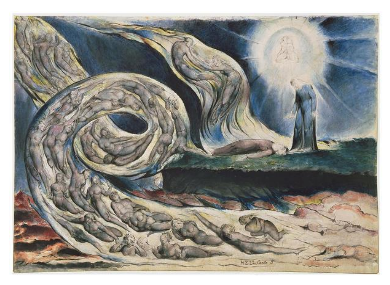
Object 10 (Butlin 812.10) "The Circle of the Lustful: Francesca Da Rimini"

sculptors, often base visual works on literary models without limiting the power of the works that they produce, but that "[O]n the contrary, this imitation shows their wisdom in the most favorable light" (Lessing 40). By the same token, Blake's illustrations of Inferno translate the wisdom of Dante, the original author, and Blake, the visionary artist who recreates it.