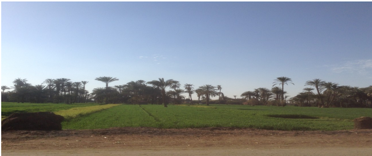
Front view of the school

the village, it took us another 20 minutes of asking passersby where our small village was. Geographically, Mallawi lies in the southern part of the Minya governorate, with ābu qrqas from the North and Mrkz Dayr Mūas from the South, and has an estimated population of approximately 680751. Mallawi itself did not strike me as agricultural; perhaps the neighboring ābu qrqas was. However, it had a lot of worn out construction buildings, police concentrations, and small local shops; which is why it is considered the administrative capital of the area. During the last 20 minutes of the drive, and while approaching our small village, the scenery began to differ; the streets became smaller, emptier, and with more agricultural lands on either or both sides.