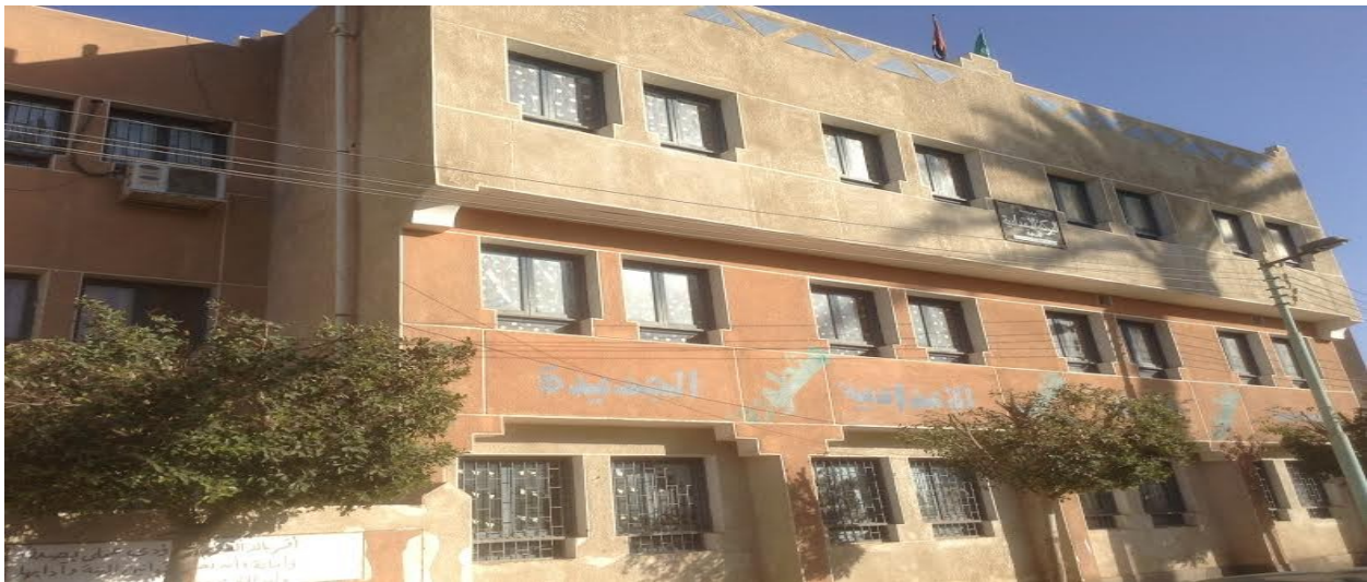
Front view of Al Berka Preparatory school

come from a small group of dedicated community members who have given the time and mental effort to come up with such solutions, was original and dedicative. In addition, CARE had mandated that community members would get involved in all stages of legalizing the lands. Community members had to acquire the approval themselves, sometimes with great difficulties as the local authorities weren't always cooperative or fast. Another fascinating example, which was story-told by interviewed community member 2, was that because they had difficulty collecting money, they would gather the leather that was removed from the slaughtered sheep during the greater Bayrum, and they would take the collected leather material and sell them for money. This money would then get installed into the community's monetary fund for the project. Needless to say, a major barrier for a few villages other than Al Berka, in specific 3, was that they had no land to give in for the construction of the schools; no State owned lands nor private owned lands. However, they had severe educational needs, and people were willing to receive assistance. In addition, citizens of the 3 villages were too poor to give donations in order to buy land. With the coordination of CARE, the governorate had bought the lands for these villages 3 villages, and these were the only example of land contributions provided by the government towards the project.