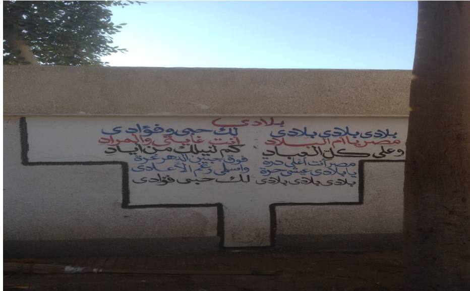
The courtyard of the school