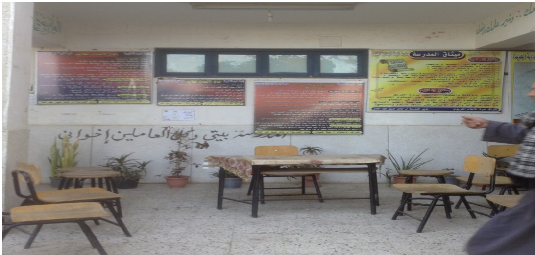
Entrance towards classes and the Principal's room