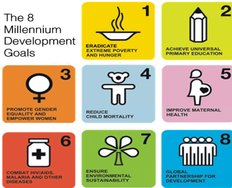
Figure 1 Millennium Development Goals

Previous researches highlighted that many places in Upper Egypt face pressing life conditions. There are unequal resources distribution in Upper Egypt comparing to Cairo and Delta. The poverty rate is the highest in Upper Egypt and specifically rural Upper Egypt (51.5 %), followed by urban Upper Egypt (29.4 %) and it is the least prevalent in Urban Governorates (9.6 %); the same applies to the poverty gap and the squared poverty gap (CAPMAS 2011).