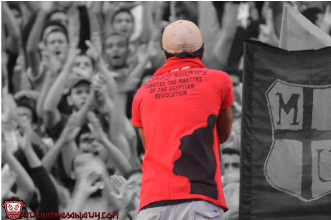
Figure 8: The Capo is leading the synchronized chanting.