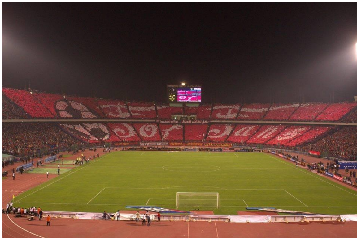
Figure 25: Tifo: Football For Fans

attending the matches as radical enough or it might be that these are not the rights that people readily register as human rights, as Harvey reminds us “the right to the city is among the most neglected rights”. This happened despite the fact that Ultras groups have stressed their right to be in the stadium over and over again, and coupled it with the rights and liberties that should be guaranteed to people after the revolution. They also stressed the fact that football is being played in the first place for the fans and hence they should have the right to watch these matches. Throughout the previous months, Ultras groups have won the right to attend some matches especially regional and international ones. Yet it is still in the hand of the police to allow or ban Ultras’ access to the stadium. The last match when UA07 individuals were allowed to the stadium, they had a tifo saying “Football for Fans” in so many languages.