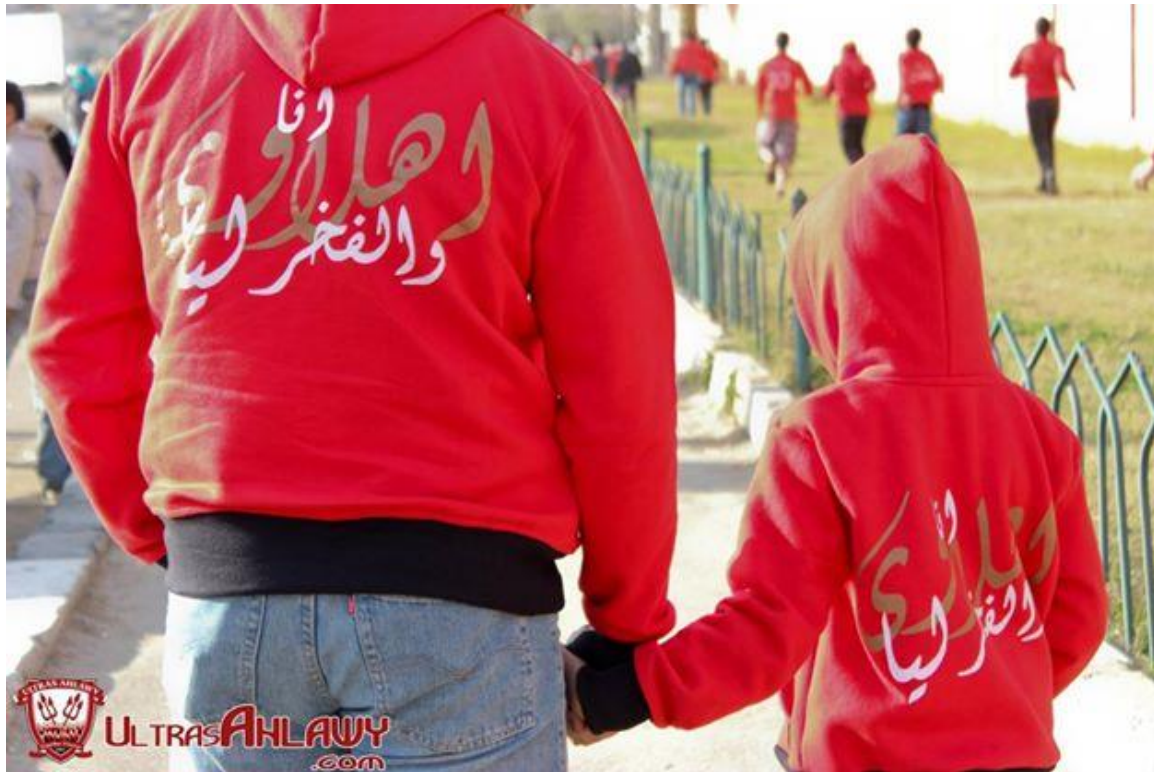
Figure 3: From father to son: an older fan accompanies his younger relative to the stadium

As for those who do not have a male relative, who would play the role model, they always find their passion at school through playing football with their schoolmates and consequently they start to develop this passion by watching matches at home or with friends.