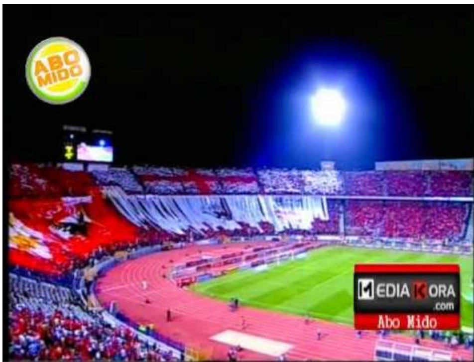
Figure 10 Tifo: Dustbin of History