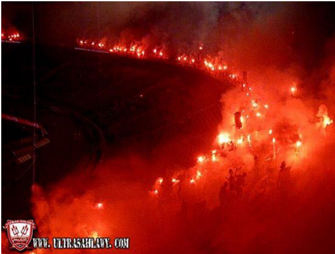
Figure 17: Pyroshow

interpretation of Spinoza's affect. Their recurrent confrontations with the police in the stadium and the resistance and aversion they face from society contribute to the creation of "a cramped space" or "a dark precursor of thought," which pushes them to reject common sense and create their own common notion (Ruddick, 2010, p. 33). This dark precursor, I argue, could be considered rebellion against the securitization and hyper-capitalization of football, even if this resistance is emerging from within the system itself or partially contained therein.