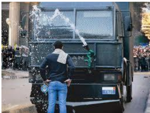
Figure 19: Egyptian protest is facing military truck on the 28th of Jan 2011.

In fact, researchers in the Committee of Documenting the Revolution, by the National Library and Archive claim that the famous guy who faced the military truck in the 28 th of January and who appears in the following photo is actually an Ultras individual.