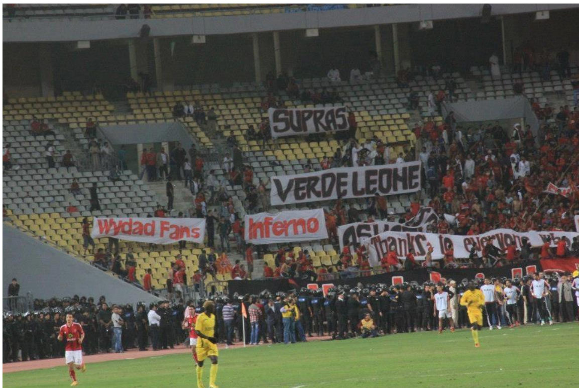
Figure 22: Security concentrated in front of the Ultras seats

The police, on the other hand, occupy surveillance positions in different places in the stadium and at the different gates inside. Security forces are also deployed extensively in front of the curve, the third class seats where the Ultras sit and sometimes they would sit between them in the terrace. The photo shows the soldiers standing disproportionately in front of the curve.