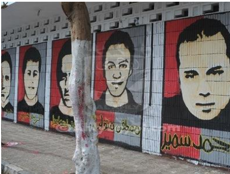
Figure 26: .Al-Ahly club's fence with photos of Port-Said martyrs. 6

The fence of Al-Ahly club is entirely sprayed with drawings of the martyrs of Port-Said massacre, in the longest strip of martyrs’ photos in the country. Graffiti artists have always drawn martyrs’ photos on the walls of Mohamed Mahmoud Street, but those drawings have been removed several times by the police, the army, certain political parties, but those on the wall of the club have been preserved. The club’s gate also holds a big banner with all their pictures and names.