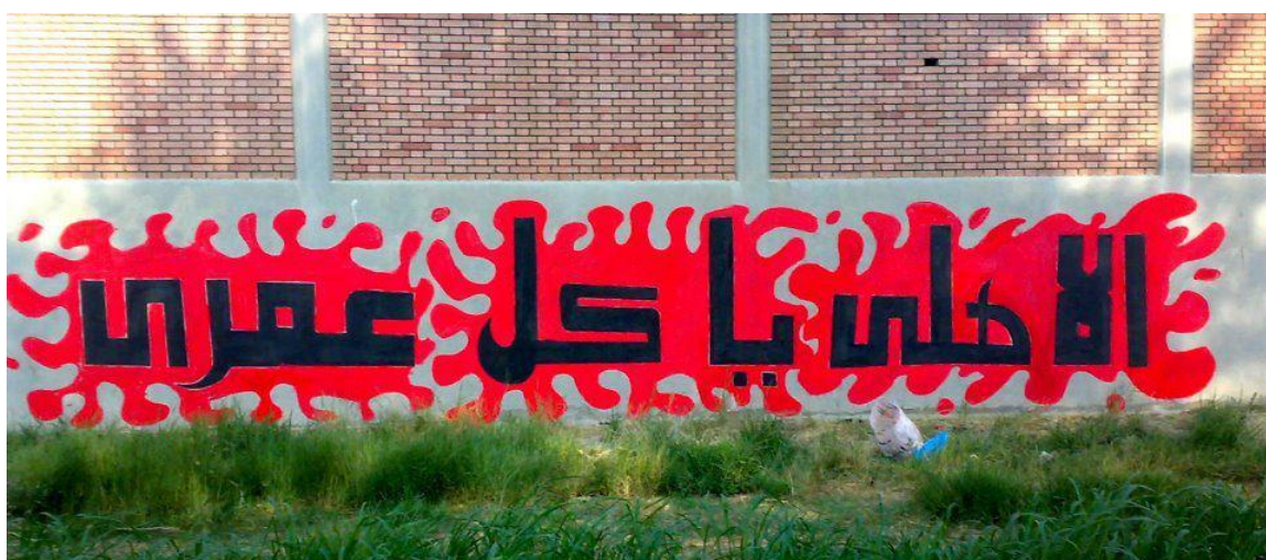
Figure 21 Graffiti: Oh Ahly, all my life

The two graffiti's showing how they choose the elongated walls.