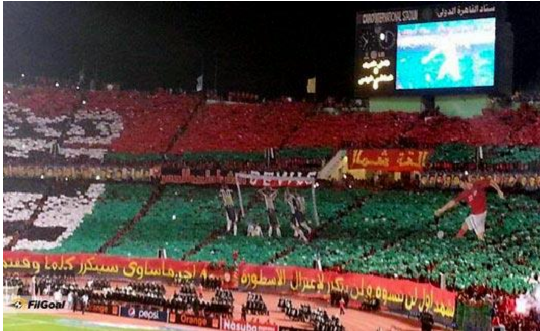
Figure 13: Tifo: Aboutrika 3D intro