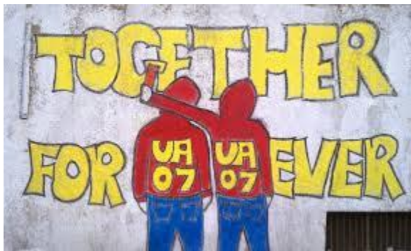
Figure 5: Graffiti: Together Forever

If you are passing by a group of Ultras, a very common scene you would encounter is young boys walking putting their hands over each other's shoulders. This scene is best captured in a mobile network advertisement that was highlighting different groups of the Egyptian people and on the segment on Ultras, you would see group of enthusiastic fans jump up and down while putting hands on each other's shoulders and chant "Oh my friend and I are shoulder to shoulder, his presence reassures me. I know he will be by my side no matter how nuts I went... he is not a family... nor a father... nor an uncle but he chose to stand by me", this voluntary fraternity is what they are willing to die for.