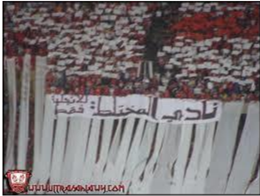
Figure 9: Tifo: the dustbin of history