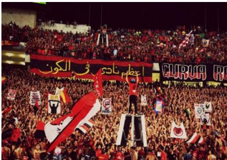
Figure 7: The capo is leading the synchronized chanting