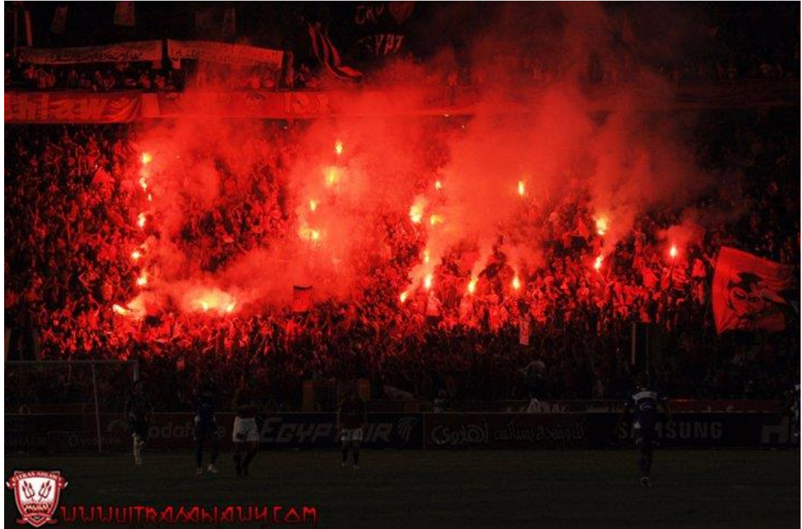
Figure 23: Pyroshow- March 2011, Cairo stadium.