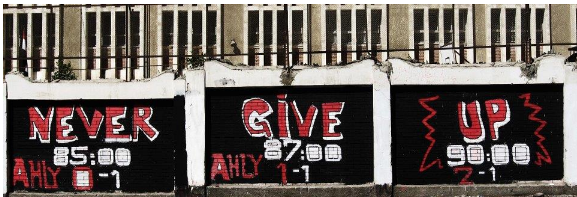
Figure 20 Graffiti: never Give Up