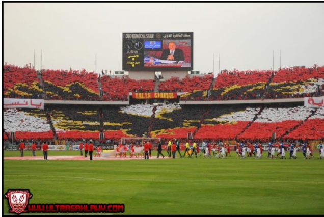
Figure 12: Tifo: Fly high freely, oh you eagle of the club of patriotism

African matches where the UA07 decided to feature the Ahly eagle in a gigantic tifo ; above it they wrote, “Fly high freely, oh you eagle of the club of patriotism.”