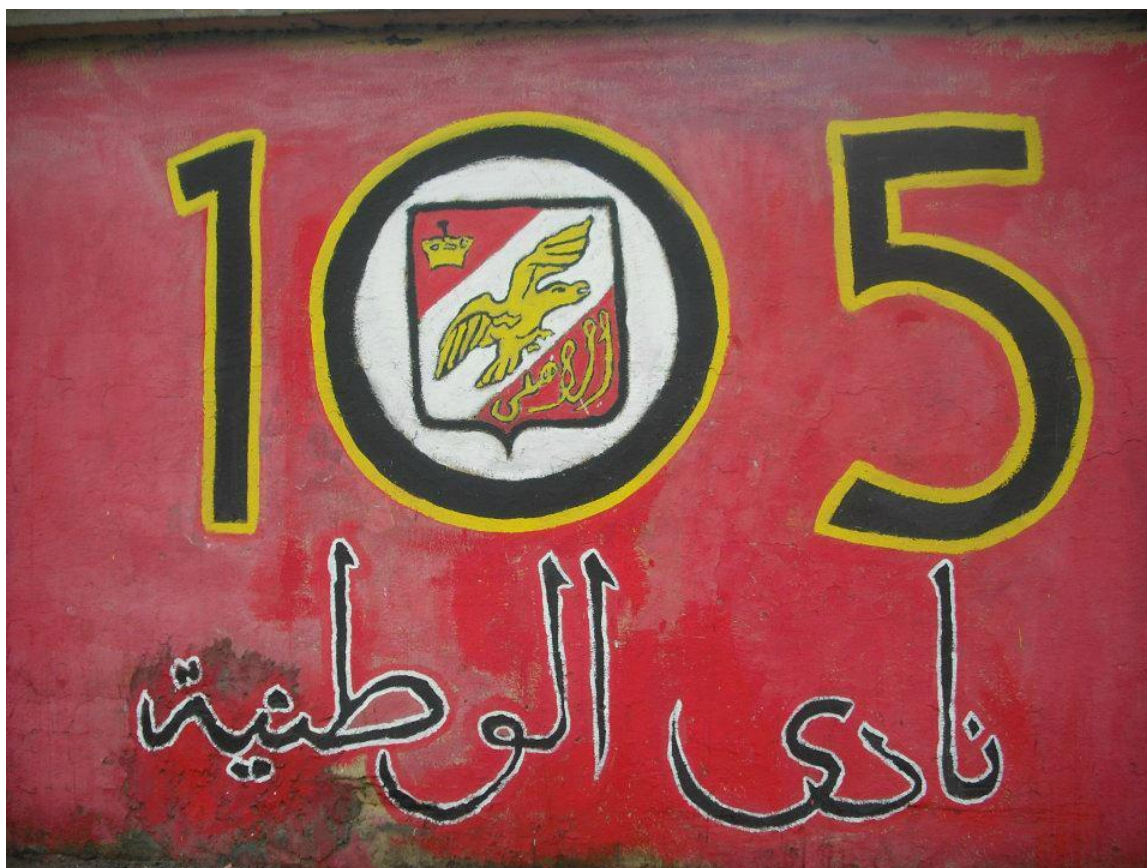
Figure 1: Graffiti: Al-Ahly is the club of patriotism

Another characteristic of nationalism as described by Anderson is that it is limited, by which he means related to a specific territory; beyond this land lies another land for another nation (1990). The same is valid regarding the nationalism of the club: it exists only in comparison and in relation to rival clubs' lack of nationalism or even disloyalty. In other words, nationalism is positional and must be exhibited in relation to other factions. As the capital's clubs, al-Ahly and Zamalek have always been the bitterest rivals in the National Champion League, and the fans of each club are always claiming that their club is the best, using different ways and discourses. Al-Ahly fans are proud that al-Ahly is the club of patriotism, while, according to them, Zamalek is the club of the English colonial power. This story was even choreographed in one of the intros to an Ahly-Zamalek match, "the Dustbin of History."