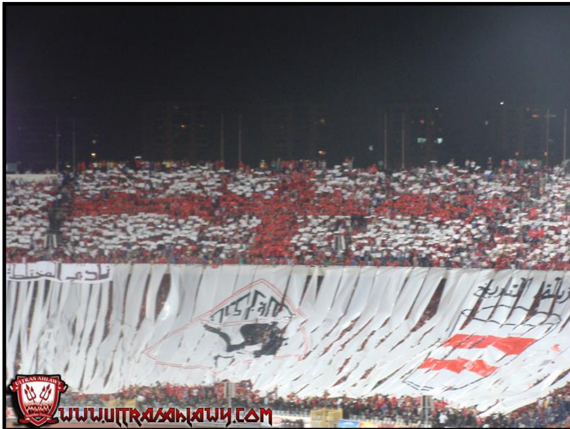
Figure 11: Tifo: Dustbin of History