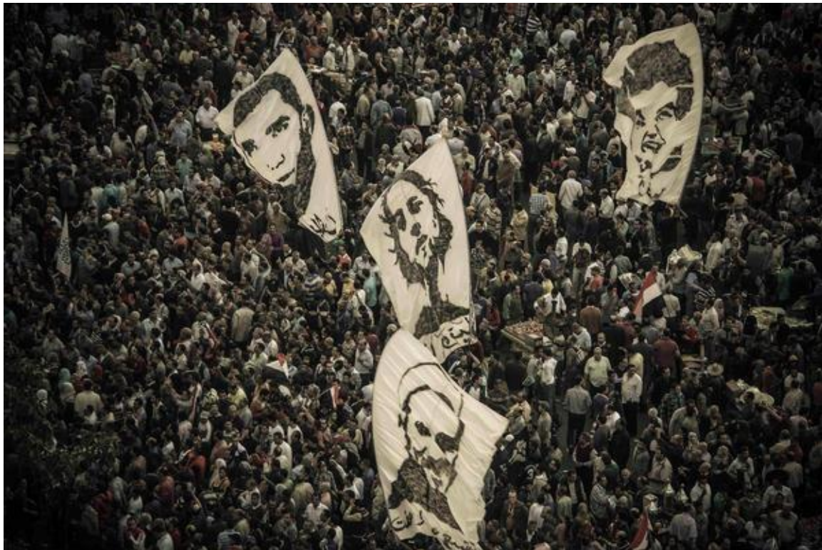
Figure 18: A photo of a protest showing the drapeaux big flags with the pictures of martyrs on them.

cheerleader would say them in the protest and the protesters would repeat them. The Ultrashas introduced the revolutionary masses to the carnivalesque resistance performances and techniques, which include using the trumpets, more whistles and big flags. This new repertoire in the resistance made the protests much more rich, colorful and enjoyable. If we look at the following photo, we will find the pictures of martyrs held on drapeau big flags, which were described in previous chapter in the rituals of the Ultras.