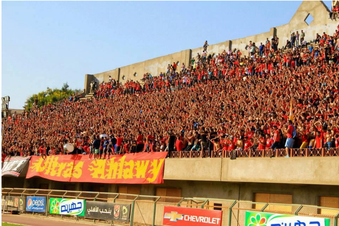
Figure 16: Ultras Gestuelles

As the match progresses, Ultras individuals are never silent for a moment and their dedication to cheering for their team throughout the entire 90 minutes of play is translated into a form of serious affective labor. Affect here does not stop at the different emotions they sense or experience in the stadium, such as joy, euphoria, sorrow, fear, or disappointment, but implies a corporeal aspect as well, where the fans are stimulated by what they are experiencing and accordingly they “move” or react physically (Thrift, 2004, p. 60) by jumping, chanting, shouting, or clapping.