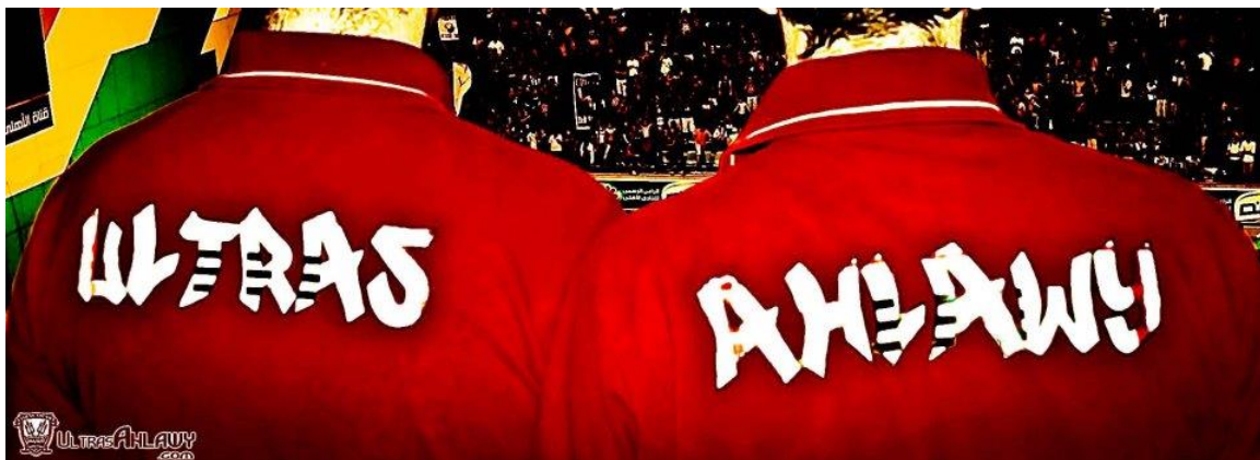
Figure 6: Fraternity