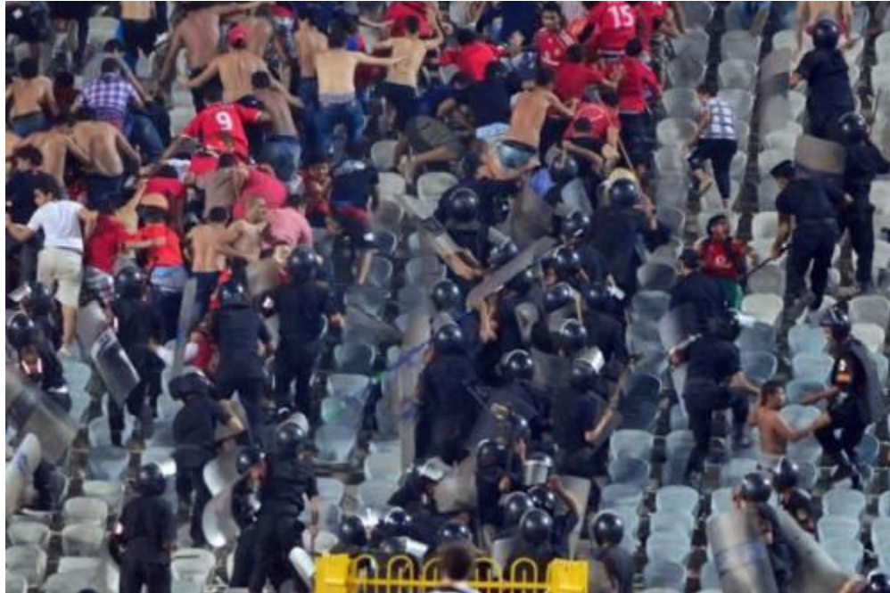
Figure 24: A still from video depicts clashes between UA07 and the police

to attack us.” A photo from Al-Masry Al-Youm newspaper shows the soldiers invading the curve where the Ultras sat and chasing them out of the stadium. Here, the boundaries were broken by the police as they converted the confrontation into a street fight in which one hundred and thirty people were injured (Fadl, 2011)