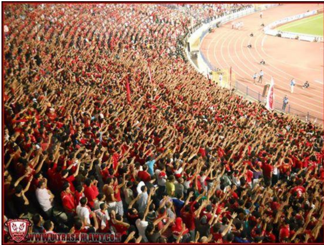
Figure 15: Ultras gestuelles.

identification, and consequently arrest, by security forces. Second, in terms of motion, every fan must raise his stunt card at the right time for the intro to be successful. They clap their hands together, stretch their hands in front of them together, and jump together. All these performances or gestuelle (a French word meaning gestures, used by the Ultras to refer to their hand performances) are orchestrated by the capos , who stand on the stadium's amplifiers with their backs to the playing field and their faces to the fans, giving them constant instructions. Moreover, Ultras are disciplined by the voice and its synchronization as mentioned above.