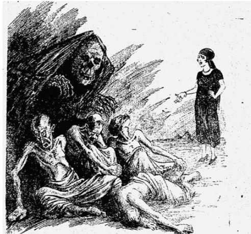
Figure 1 The Drug Victims

basically turns humans into corpses. 130 However, the caricatures and images accompanying these articles were even more provocative: Like the images below, the first one shows a mother mourning her drug addicted sons, and the second image compares the bodies of a heroin addict and a “healthy man”.