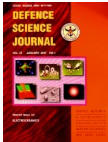
1997-2007 (21 cm × 27 cm)