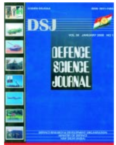
2008 onwards (21 cm × 27 cm)