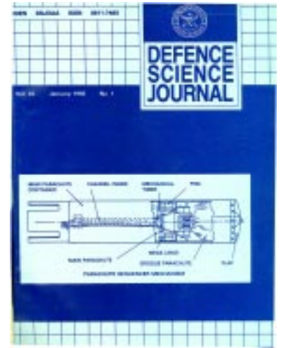
1992 (21 cm × 27 cm)