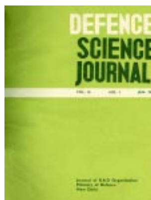
1968 (17 cm × 24 cm)