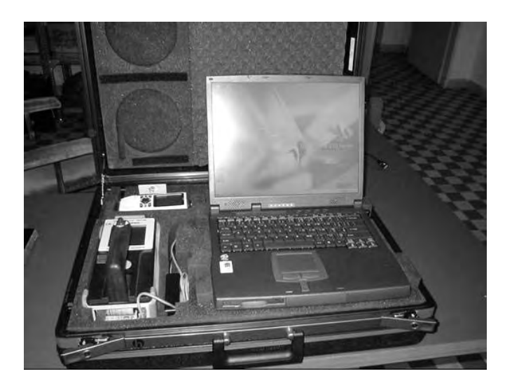
Figure 4. Equipment of the mobile group.