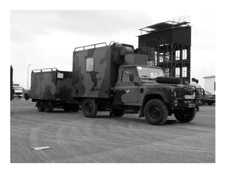
Figure 3. Landrover of the Armed Forces of the Czech Republic mobile group.

Laboratory Groups: They collect environmental samples and carry out spectrometric or possibly radiochemical analyses of environmental samples, with the aim to determine activities of radionuclides in these samples. There are 13 laboratories provided by regional centres of the State Office for Nuclear Safety, local laboratories for control of surroundings of the Dukovany and Temelin Nuclear Power Plants, T G Masaryk Research Institute of Water Management, and State Verterinary Institute<sup>3.6.7</sup>.