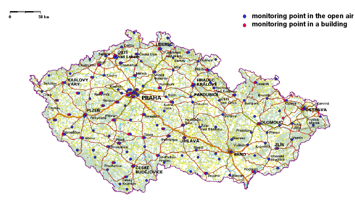
Figure 2. Network of thermoluminescent dosemeters (www.suro.cz).

sampling the fallout. Local networks of points for measuring atmosphere contamination are operated by Laboratories of Radiation Control of Surroundings of the Dukovany (6 points) and Temelin (7 points) Nuclear Power plants<sup>3,6,7</sup>.