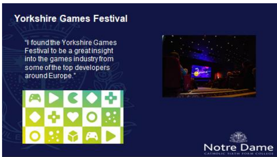
Figure 3: Future Programme – Yorkshire Games Festival