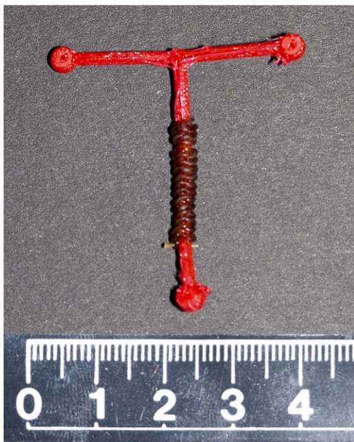
FIGURE 1 Printed implant from Experiment 2. A 30-throw Chinese finger trap suture pattern of #1 catgut has been placed on the vertical portion to enhance urolith adherence

with #1 catgut (Catgut Chrom, B Braun Aesculap, Center Valley, Pennsylvania, 18034) suture placed in a 30-throw Chinese finger trap suture pattern on the shaft (Figure 1). In both experiments, the prepared implants were weighed and stored in isopropyl alcohol before implantation.