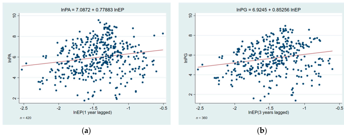
Figure 1. (a) Energy price and green energy patent applications; (b) Energy price and green energy patent grants.