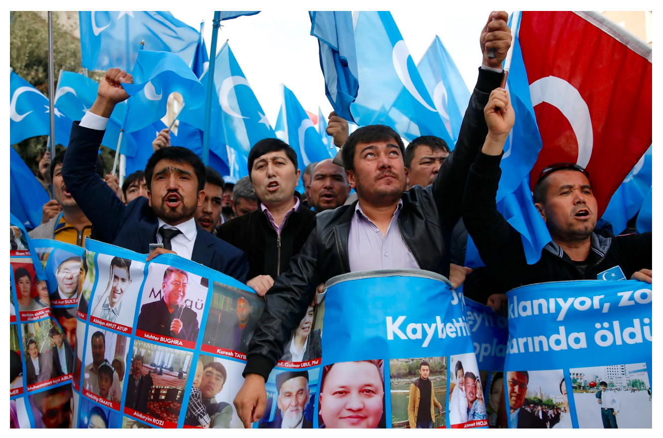
Chinese Uyghurs demonstrate in Istanbul, Turkey.

by Fiona B. Adamson and Gerasimos Tsourapas