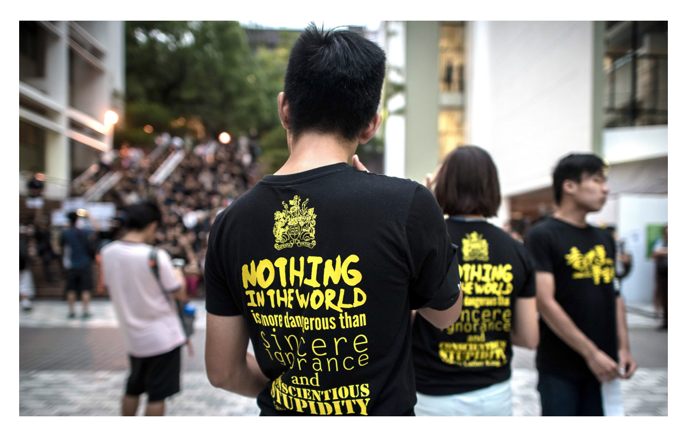
Students gather to call for academic freedom at Hong Kong University as fears grow that Beijing is interfering in the city's education.