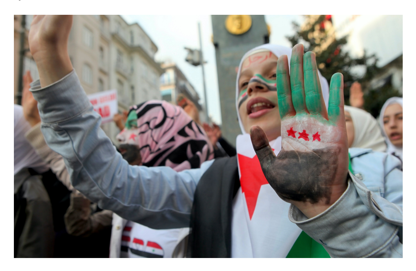
Syrians living in Istanbul protest the regime of Bashar Essad in front of Syrian Consulate in Istanbul, Turkey.

A ctivists in authoritarian states face steep costs in working for democracy and human rights, and for many, their only hope to survive is to escape abroad. When survivors of state violence secure refuge in democracies, they gain the opportunity to continue their activism and express their voices in new ways. Diaspora activists, in turn, play a number of important roles in the global fight for transparency, freedom, and human dignity. As this report details, these roles include spreading awareness about regime abuses, assisting dissidents working on the ground, launching protests, pursuing justice, demanding that their host-country