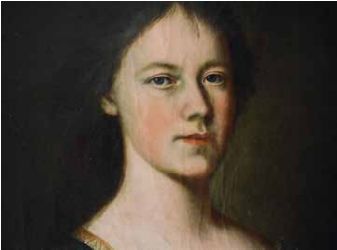
Maria von Herbert