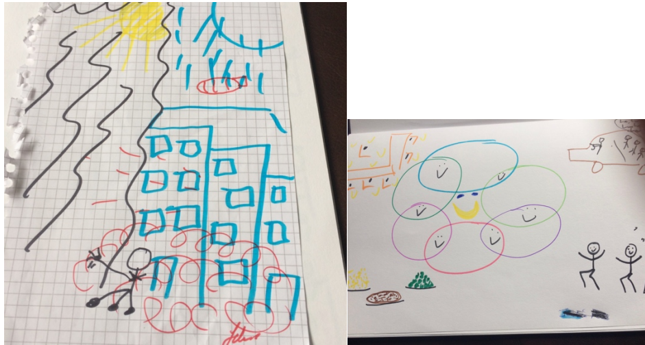
Drawing on the left: Tim, a council worker (figure 3). Drawing on the right: Meg (figure 4), a volunteer

Category 2. The drawing expanded on what had been said or was trying to reframe the tale in a different dimension.