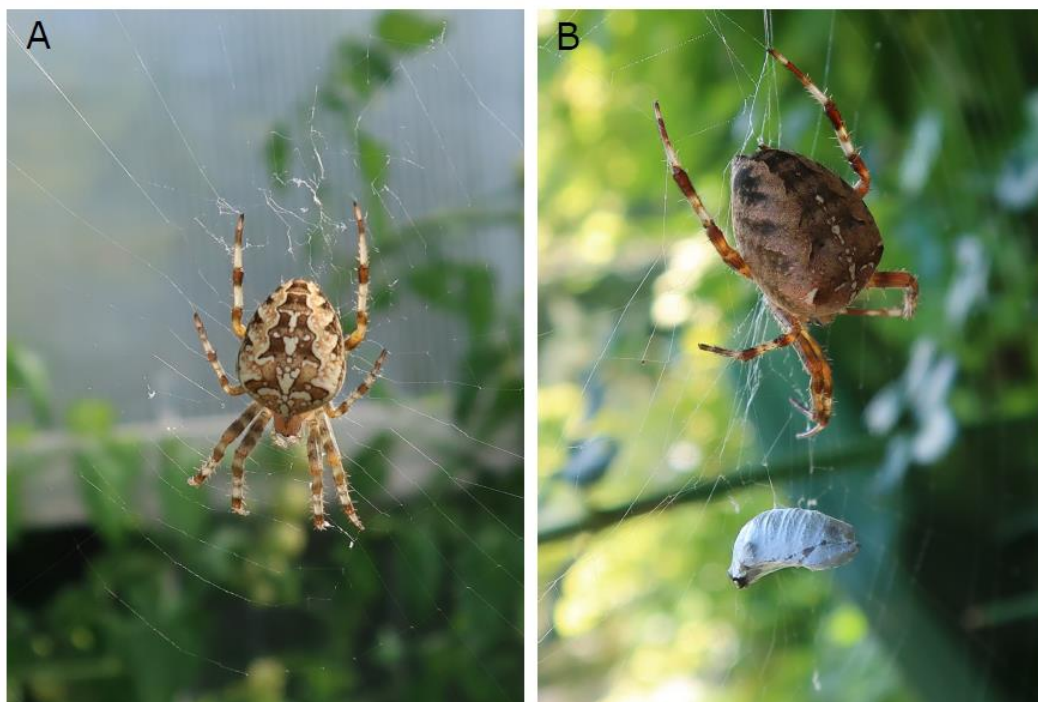
Figure 2. (A,B) Adult female Araneus diadematus in web in a garden in Flawil, northeastern Switzerland.