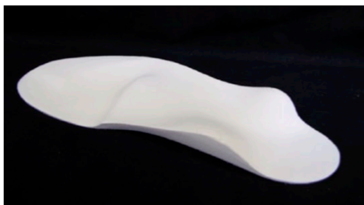
Figure 1. Sensorimotor orthosis [24].

The AFOs were custom-made through public or private orthotists from polypropylene with velcro straps holding the foot in place. The AFOs all had a full-length foot plate. Due to the AFOs being the participants 'usual prescription' there was no further assessment or measurements of the AFOs performed. The SMotOs were custom made for each child from ethyl vinyl acetate and had been assessed and prescribed by a podiatrist or pedorthist who were both expert in this design type of orthosis. Figure 1 shows the finished SMotO [24]. Figure 2 illustrates the placement of toes (circles) metatarsal heads (crosses), and plantar fascia (lines).