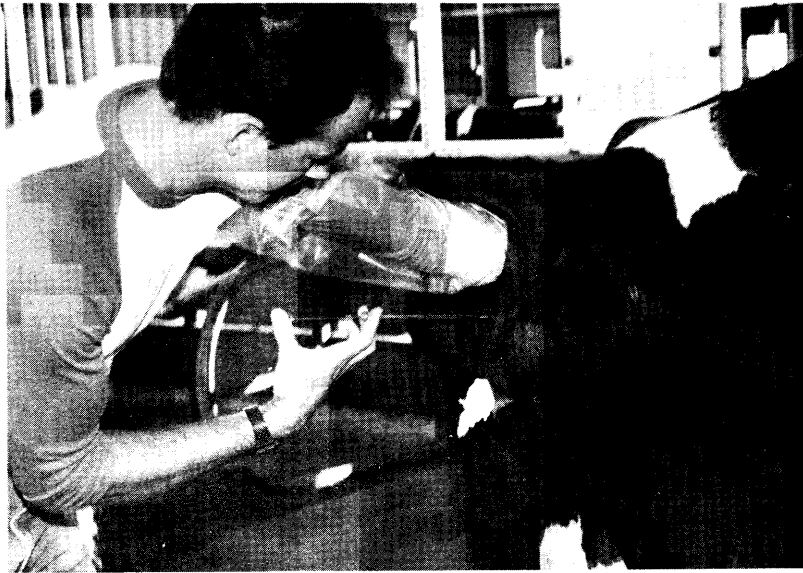
FIGURE 4. Strict sanitation procedures and correct semen placement are necessary to obtain satisfactory results with AI.