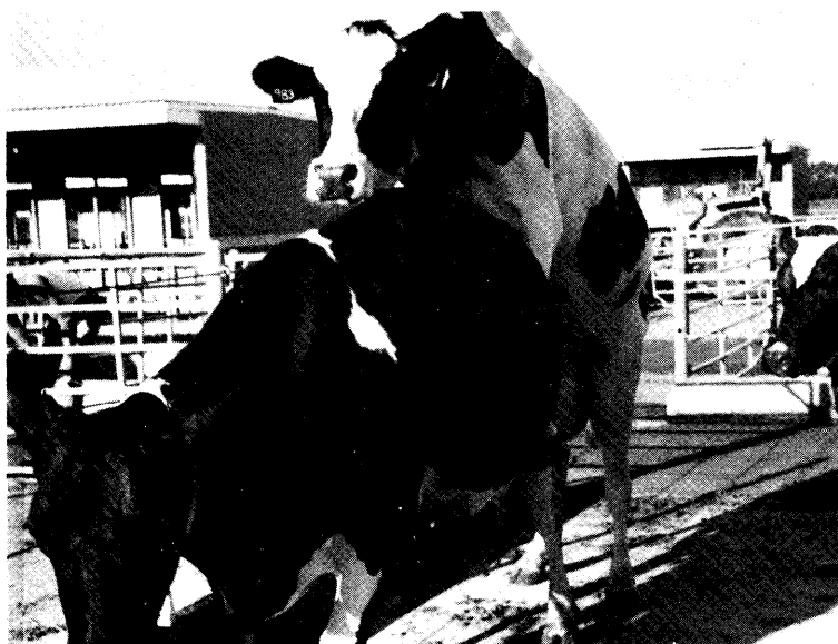
Figure 1. Heat detection is the main management problem in the AI program. A heat expectancy chart will increase the number of animals detected in heat along with recognizing the subtle signs of heat.

Rump patches and tail-head painting may be of benefit when interpreted properly. The biggest value of these devices may be that they call attention to the fact that the cows should be observed more closely for heat. While heat detection aids have a place in an AI program, the final decision to breed the cow still requires judgement.