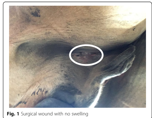
Fig. 1 Surgical wound with no swelling

At 24 h post-surgery, 6/21 (29%) horses sutured with KBS had a minor swelling in relation to the surgical wound uni- or bilaterally and 8/24 (33%) horses sutured with SS had a similar minor swelling uni- or bilaterally (Figs. 1 and 2). Two horses sutured with SS and two sutured with KBS had minor or moderate cutaneous dehiscence, which developed during recovery. It was the same surgeon (surgeon E), who performed the two castrations, where dehiscence occurred in the SS group and the same surgeon (surgeon D), who performed the two