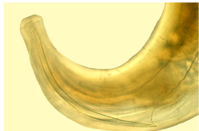
Figure 1. Light micrograph of Aspiculuris mexicana n. sp. showing cervical ala extension.

Male (based on holotype, 2 paratypes, one of them studied under SEM). Body length 2.81 mm (2.21-3.42; n = 2), width at middle body 110 (80-130; n = 2); cephalic