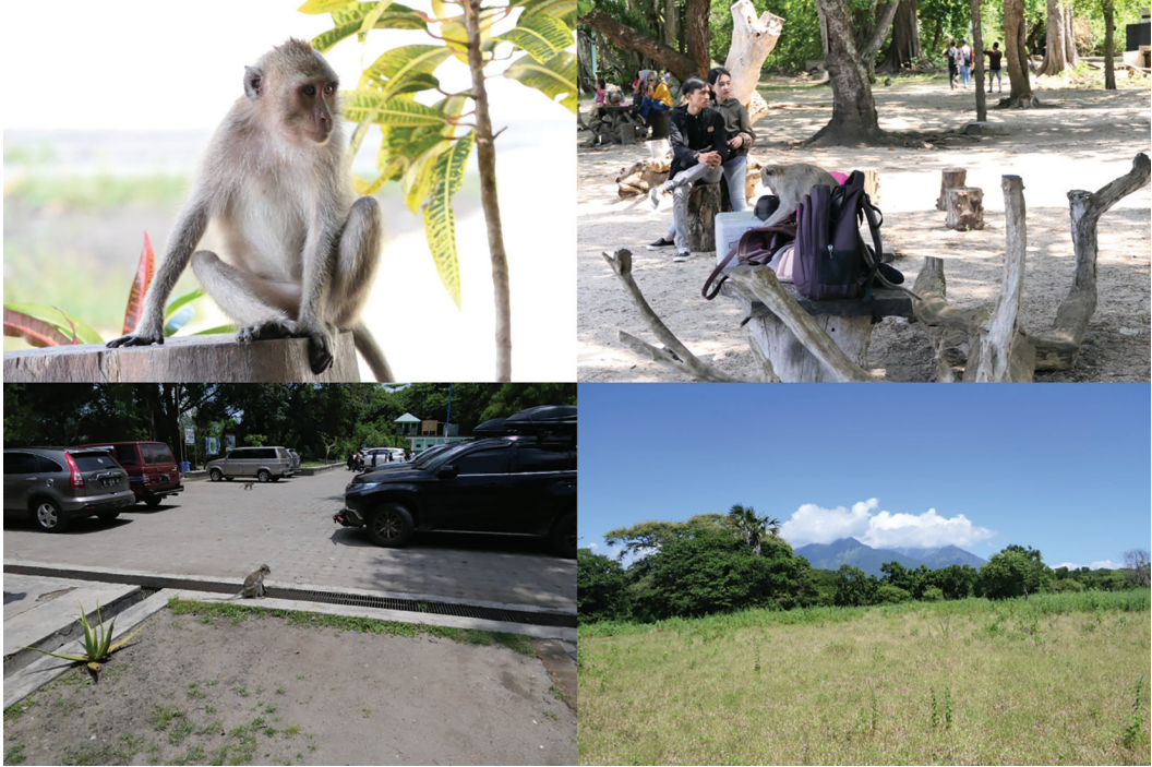
FIGURE 1 Above left: Juvenile long-tailed macaque ( Macaca fascicularis ) from the provisioned group at Bama beach. Above right: One of the collared females in the provisioned group at Bama beach searching through backpacks after her collar had been remotely released. Her collar was the one that collected data for the provisioned group. Below left: Bama beach parking lot with two long-tailed macaques among the vehicles. Below right: Habitat of the non-provisioned group with restored savannah, native acacia trees ( Acacia leucophloea ) and mount Baluran in the background. All photos are from Baluran National Park, east Java, Indonesia by Malene Friis Hansen.

previously given birth assessed by nipple shape and size) to ensure the individuals would not grow extensively while wearing the collar. Groups are generally very cohesive, and travel together (van Schaik & van Noordwijk, 1988).