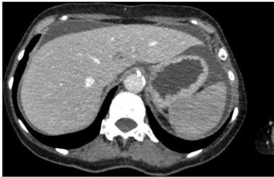
Fig. 1. CT-scan of the patient showing ascites fluid in the perihepatic region.