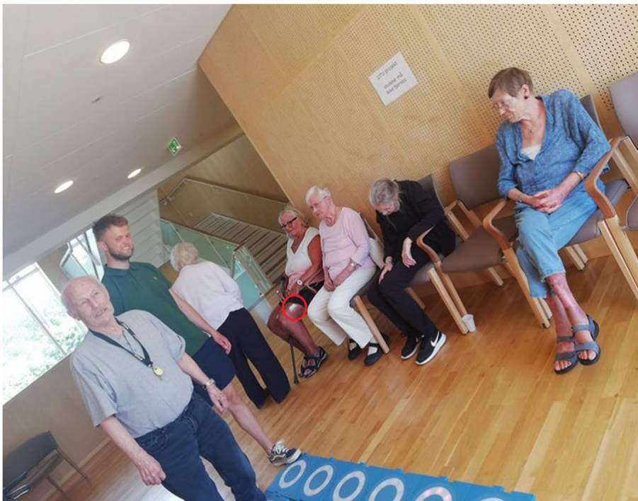
Fig. 2 Training session with Moto tiles (SENS patch encircled in red)

Assistants meet with each control group participant once a week for 5–10 min in order to: (a) encourage their continued participation, and (b) check whether activity trackers were functioning and to exchange the plaster holding the tracker.