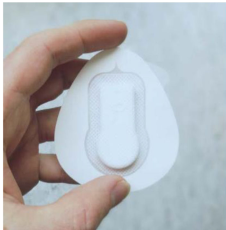
Fig. 1 SENS motion activity tracker

The tracker was attached to the leg above the knee with a plaster, changed once a week with assistance from a student. Participants were measured on Berg Balance Score (BBS), 30 Second Chair Stand Test (CST) and 6 Minute Walk Test (6MWT) at the beginning (baseline) of the study, midway, and at the end. After completing the baseline measurements and signing the informed consent, participants were assigned to two groups by block randomisation (Efird 2011).