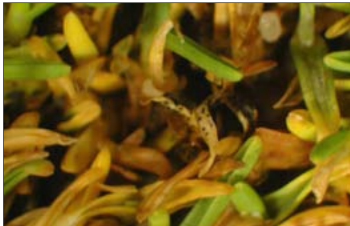
Figure 2. Black spore-producing structures (acervuli) mark the spore-producing bodies on the yellow leaves.