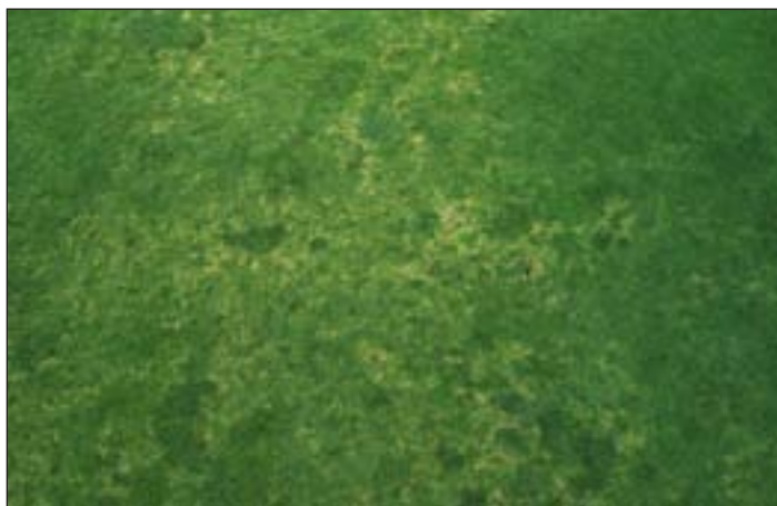
Figure 1. Bronze cast on a mixed bentgrass/annual bluegrass green.

Basal crown rot occurs when the anthracnose fungus infects the crown. Plants with basal crown rot are killed, resulting in a thinning of the turfgrass. Acervuli and small, black fungal resting structures are visible with a hand lens (Figure 4).