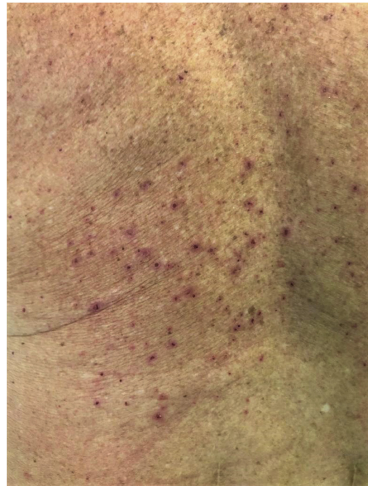
Fig. 1. Cutaneous manifestation of COVID-19 in Case 1.

A 72-year-old Caucasian woman, otherwise healthy, presented to the Emergency Department in Milan with headache, arthralgia, myalgia and fever. Four days later, a papular-vesicular, pruritic eruption appeared on sub-mammary folds, trunk and hips (Fig. 3). Laboratory examination conducted revealed mild increase in WBC, C-reactive protein and erythrocyte sedimentation rate (ESR). COVID-19, tested with naso-pharyngeal swab, was positive. Chest X ray was negative for pneumonia. Complete remission of both general and cutaneous manifestations was observed approximately ten days after the beginning of the clinical picture.