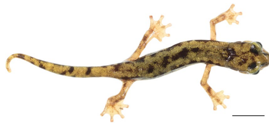
Fig. 2 Example of Hydromantes picture from the database. Here an individual of H. flavus photographed using the described methodology; scale bar 10 mm.

custom white balance profile using the respective picture of the Pantone colour card as reference. We then applied the profiles to the respective images and converted them into JPEG format, which enables reduction in the size of pictures without compromising their quality.