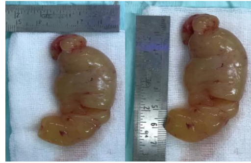
Figure 3. Posterior view of mediastinal structures. In the right side right lung is lifted. 1) Lifted right lung; 2) Lifted left lung; 3) Azygos vein; 4) Inferior vena cava; 5) Azygos' confluent small vessel; 6) Descendent tract of thoracic aorta.

The last one is further subdivided into the anterior mediastinum, middle mediastinum and posterior mediastinum. After the pericardial incision, the dissection continued lifting firstly the right lung and then the left one, in order to observe the posterior structures of mediastinum, as showed in figure 3.