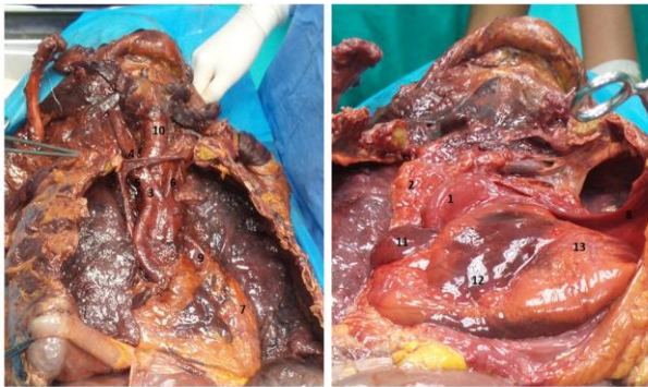
Figure 2. Anterior view of the thoracic cavity. In the right side the pericardium has been opened. 1) Arch of aorta; 2) Superior vena cava; 4) Brachiocephalic vein; 5) Neurovascular bundle of the neck; 6) Origin of the left subclavian vein; 7) Left common carotid artery; 8) Pericardial fat pad; 9) Opened pericardium; 10) Pulmonary trunk; 11) Trachea; 12) Right atrium; 13) Right ventricle; 14) Left ventricle

Removed the chondrosternal complex, we have accessed the thoracic cavity (Figure 2). The central compartment, delimited in each side by mediastinal pleura, of the cavity is the mediastinum. Anatomically, the mediastinum is divided into two parts by an imaginary line that runs from the sternal angle (the angle formed by the junction of the sternal body and manubrium) to the T4 vertebrae: Superior mediastinum – extends upwards, terminating at the superior thoracic aperture, and inferior mediastinum, extends downwards, terminating at the diaphragm.