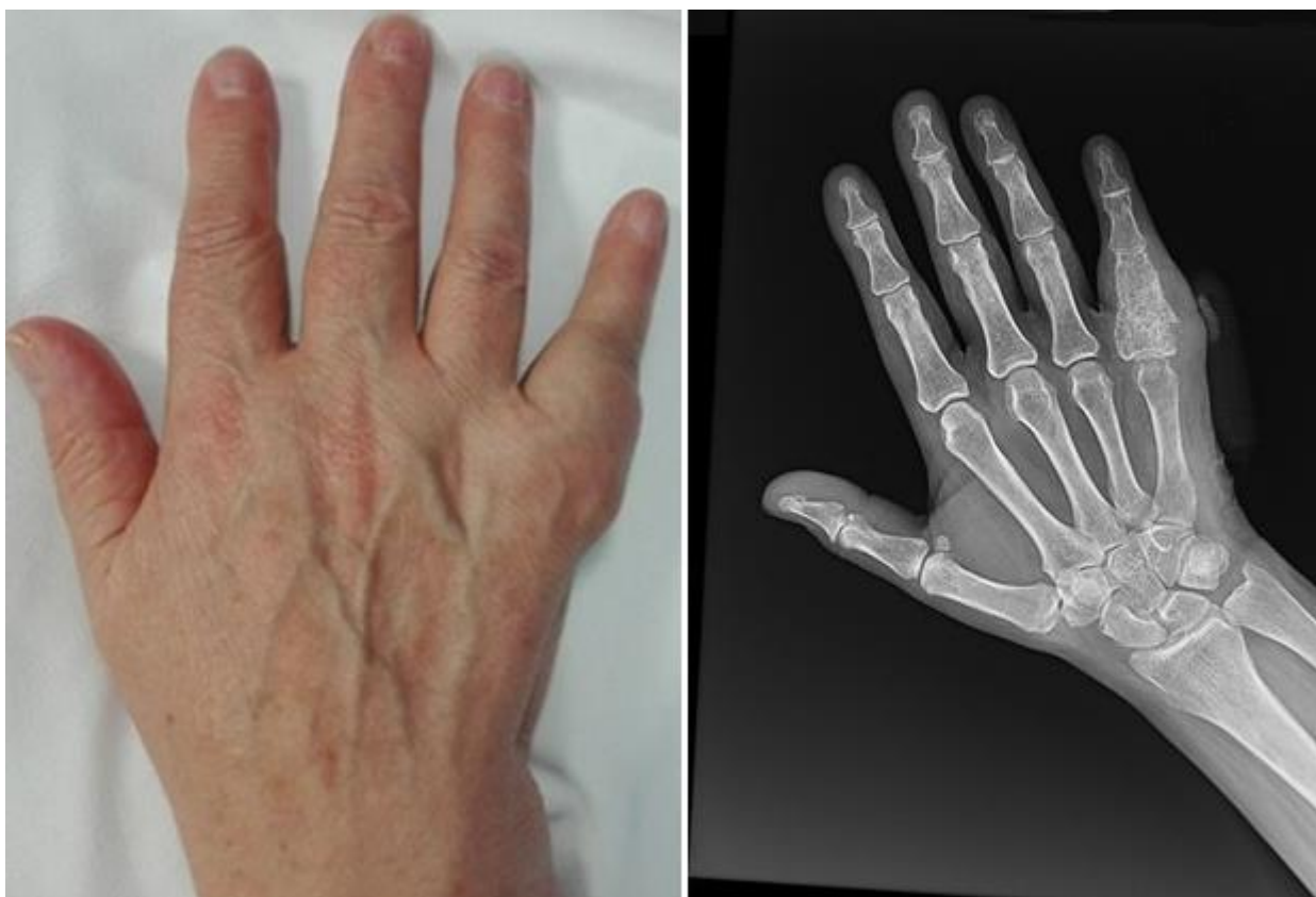
Figure 1: five years after surgery, the patient returns for pain, swelling and functional limitation; this image highlights the hand and the X-ray with evident recurrence of the pathology