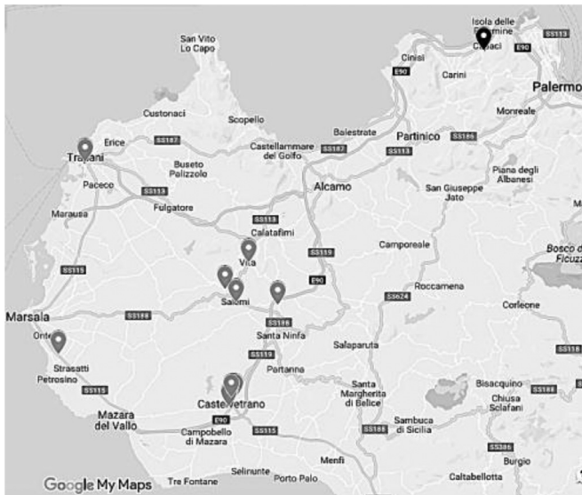
Fig. 2. Location of the clients.