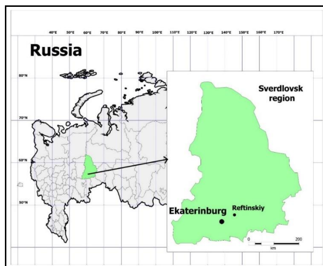
Figure 1. Map of the study area

The investigations carried out have shown that ash in the ash dump № 1 is characterized by heightened as compared with soil, content of microelements as well as available nutrition elements of plants ( P_2O_5 and K_2O ). Weak alkaline reaction of ash spread by wind promoted soil dioxidation that results in soil fertility increasing significantly on territory of adjacent stands. The forest management plans data of Sukholorhsky forest district testify to the fact that growth site index capacity in the forest district where Reftinskaya power plant is located has been changed from 1970 to 2000. If in 1970 the Scots pine ( Pinus sylvestris L.) stand share of I a and I classes of growth site index capacity constituted 17.9%, in 2000 the Scots pine plantations share in these growth site classes shows portion of 43.6% (Table 1).