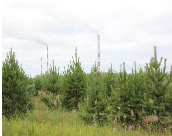
Figure 2. Establishment of Scots pine plantation on the ash dump of Reftinskaya power plant

In 2011, Reftinskaya power plant ash dump № 1 recultivation was entirely completed. On its territory, a total of 360.2 ha of pine stands have been established (Figure 2, 3).