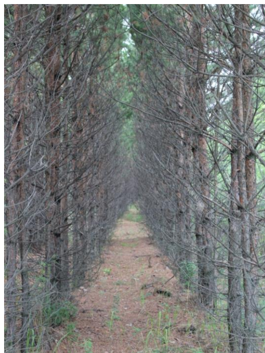
Figure 3. 20-years old Scots pine plantations on the ash dump of Reftinskaya power plant

At the age of 20 artificial stands are characterized by 143 m 3 /ha stem volume that corresponds to yearly increment of 7.15 m 3 /ha. In other words, artificial stands established on the ash dump exceed the stands of analogous age established on felled sites of the most productive forest types (Table 6). In addition, it can be seen that the stand volume, diameter and height change according to plantation age (Figure 4).