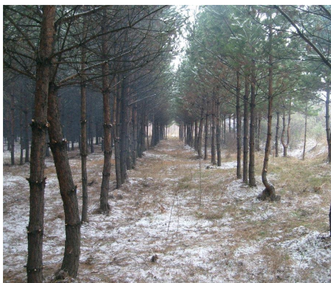
Figure 6. 20-years old Scots pine plantation with trimmed branches

The state of the path network, the removal of living ground cover and trimming of the lower branches excludes the possibility of the transfer of grassroots ground fire to the tree crowns.