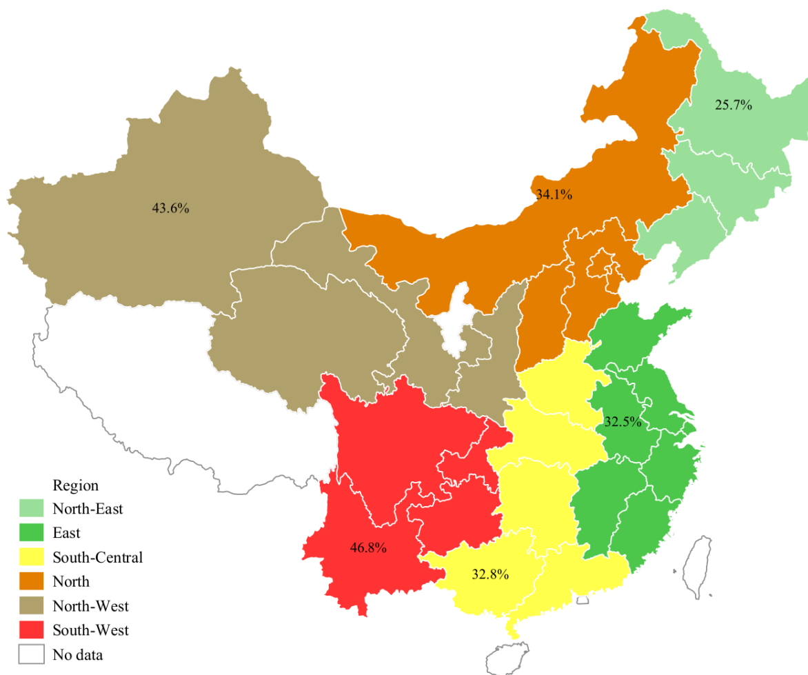
Figure 1. The age-adjusted somatic-mental multimorbidity (SMM) prevalence by geographic location in China, 2013.