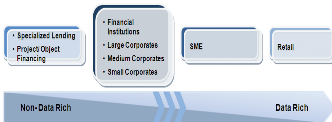
FIGURE 2. Data rich vs. non-data rich credit risk scoring models

In fact, credit risk is the distribution of financial losses due to unexpected changes in the credit quality of counterparty in a financial agreement. Industrial Bank has developed sophisticated systems in an attempt to model the credit risk. Such models are intended to aid in quantifying, aggregating and managing risk, performance measurement processes, risk-based pricing, active portfolio management and capital structure decisions. The types of credit risk scoring models within Industrial Bank can be illustrated with a segment falls along a spectrum ranging from Non-Data Rich to Data Rich credit risk scoring models, with best practices falling towards the Data Rich credit risk scoring model.