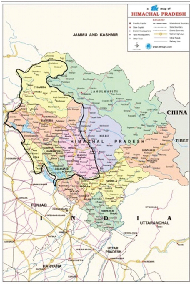
Figure 1: The black marked area served by RPGMC, Kangra

This study was designed for better understanding in the present scenario of the clinical and risk factor profile of stroke in this hilly, rural area of the state. This will help us in planning the best strategies in terms of prevention and management of stroke.