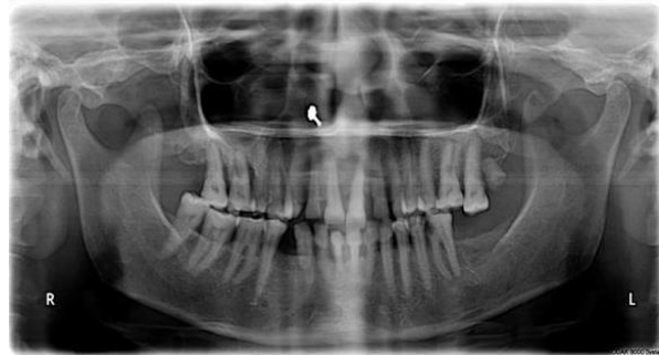
Figure 2: OPG showing mildly eroded mandibular cortex (C2)

The results were tabulated and analyzed to assess the relation between the MCI of panoramic radiograph and the bone mineral density obtained from DEXA of L2 to L4 region. Intraobserver and interobserver agreement for the classifications in MCI was also calculated.