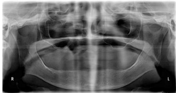
Figure 3: OPG showing severely eroded mandibular cortex (C3)

The correlation between the different grades of the MCI of orthopantomograph and bone mineral density obtained from DEXA was compared. Spearman's Rank Correlation coefficient was used to find the association between the different grades of MCI and BMD. The intra-observer and inter-observer reproducibility was calculated by using Cohen Kappa Statistics.