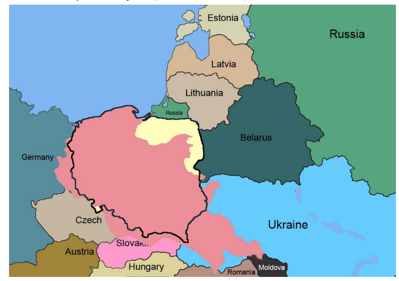
F.2 Piast Territories as a Mythical Composite (see the Piast Formula)