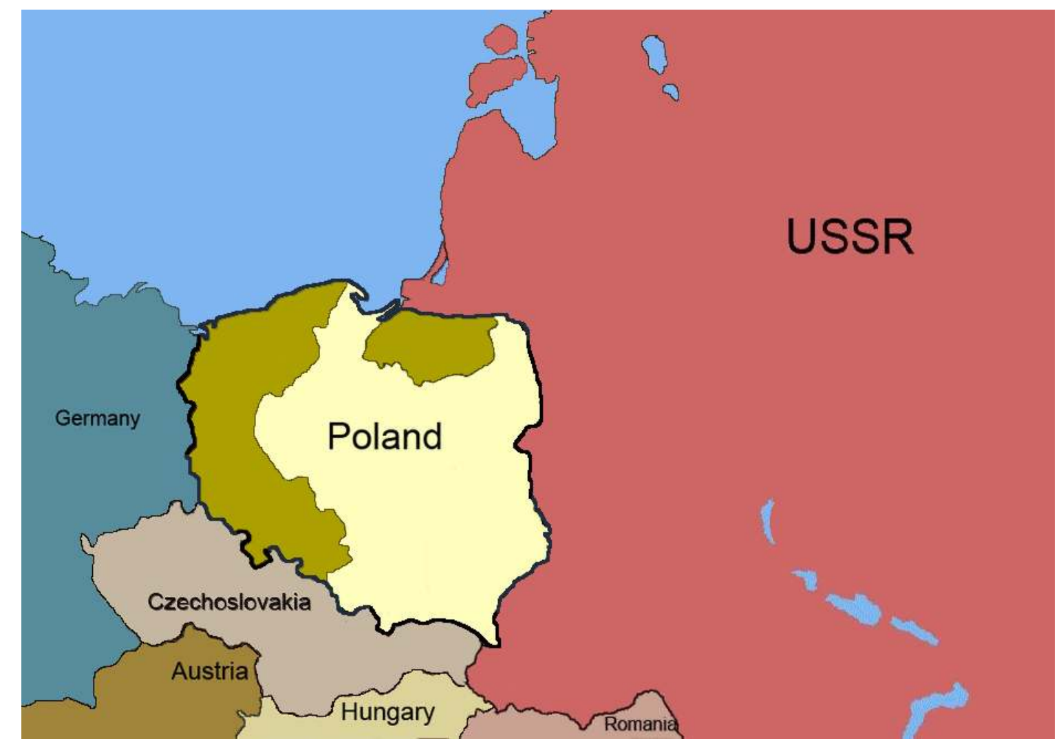
F.7 The 'Regained Territories' (Ziemie Odzyskane)