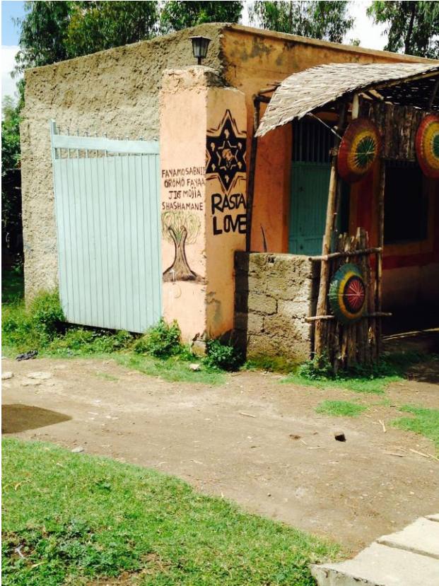
Oromo & Rasta Love (Shashemene, Ethiopia)