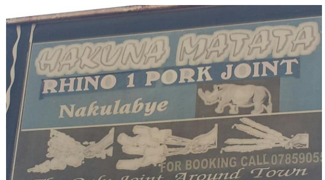
Fig. 1: The ‘Rhino 1 Pork Joint’ in Nakulabye neighborhood

Kiswahili has, apart from its use in everyday conversations for various pragmatic reasons, made its way onto billboards and banners that advertise restaurants, bars and special offers, as part of the linguistic landscape, understood as “the scene where the public space is symbolically constructed” (Ben-Rafael, Shohamy & Barni 2009). As shown in Fig. (1), the proverbial Swahili expression hakuna matata (‘no problem’) is used to emphasize the comfort of the restaurant ‘Rhino 1 Pork Joint’, and potentially also the chef’s mastery of (and authority in) the good East African muchomo barbecuing tradition.