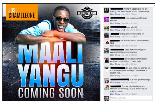
Fig. 5: Online advertising for Jose Chameleone's upcoming single

In Uganda's music industry, too, Kiswahili plays a significant role, both as a commercial strategy and in the quest for a feeling of unity across music genres, languages and styles. The popular musician 'Dr.' Jose Chameleone, who spent a considerable part of his early career in Kenya, sings entirely in Swahili, which has become both his personal trademark and a general popular feature of Ugandan music. The use of Kiswahili has become indexical of the city's music industry and its contemporary popular culture, and is also used in social media. In 2013 and 2014 I usually crossed paths with Jose Chameleone at least once a month in one of the crowded Kampala bars such as 'BBQ Lounge' or 'Bubbles', and he would be noticeably happy when I addressed him with "mzee, habari za leo? mambo vipi?" ('Old man, what's the news today? What's up?'). The encounter with strangers who address him in Kiswahili in the evenings confirms the success of his professional choice of languages, and serves as a recognition factor of his label as a 'Swahili artist'. The advertising of his upcoming single Maali yangu ('my property/my wealth') has led to a multi-faceted and metrolingual exchange of comments on Chameleone's Facebook page (see Fig. (5)).