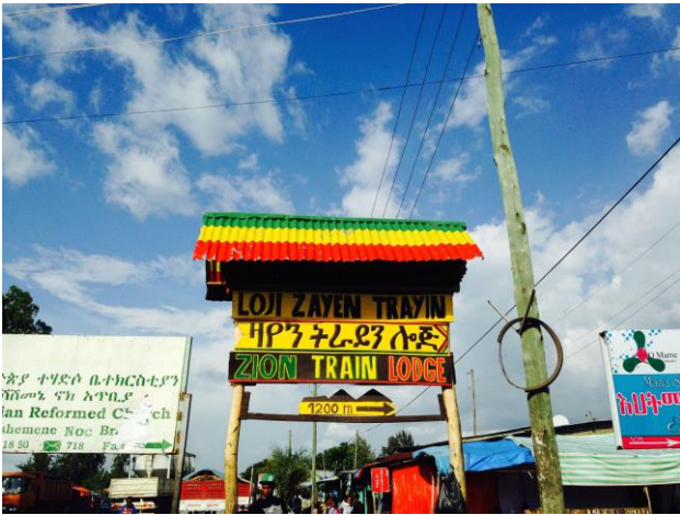
Zion Train Lodge (Shashemene, Ethiopia)