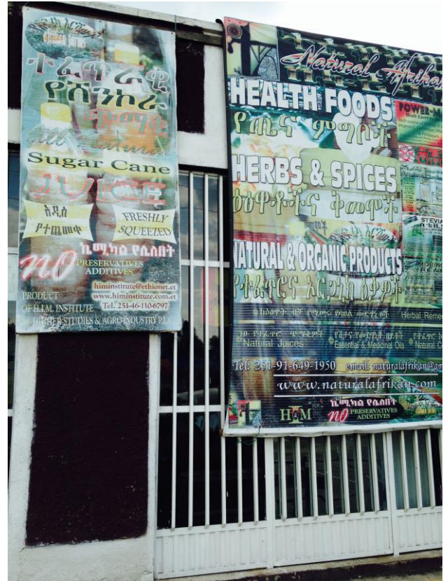
Health food (Shashemene, Ethiopia)