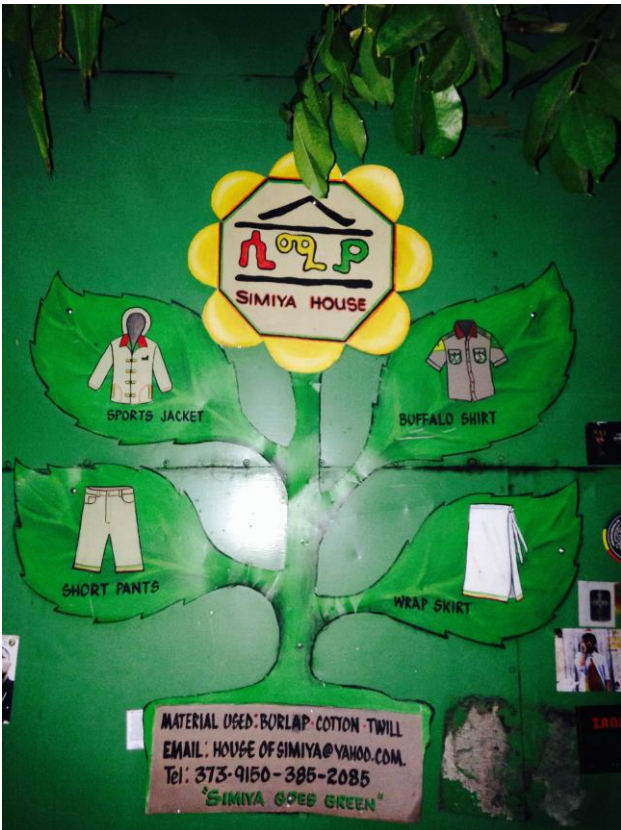
Simiya House (Kingston, Jamaica)