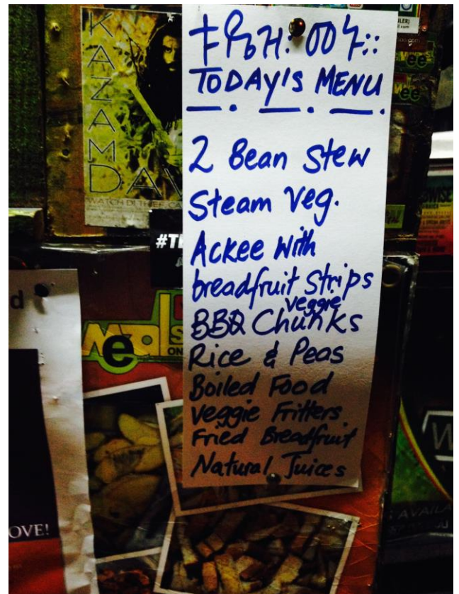
"Today's menu" at the veggie meals on wheels restaurant (Kingston, Jamaica)