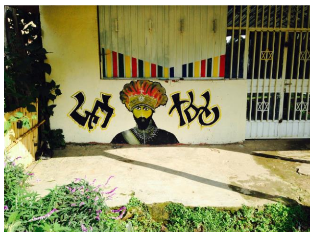
ራስ ተፋሪ Ras Tafari (Shashemene, Ethiopia)