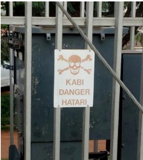
Fig. 2: A power distributor in Makerere-Kivvulu

The second example of the prominent use of Swahili in the urban linguistic landscape is the sign attached to power distributors that can be found all across Kampala, which is presented in three languages, namely Luganda ( kabi ), English ( danger ) and Kiswahili ( hatari ). Again, as is also the case in everyday language, Swahili is employed to underline the danger and severity (due to the high voltage) associated with the act of trespassing in the marked area. The indexical function of Swahili as a language of authorities and ‘uniforms’ also operates here.