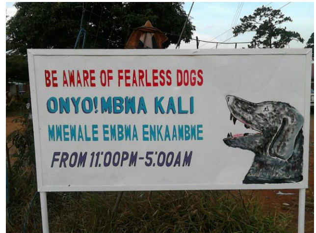
Fig. 3: The use of multilingual signposts to warn against dogs at Bugema University

The third photograph was taken at one of the side entrances of Bugema University (Kampala-Makerere), where nocturnal thieves are warned against trespassing by indicating the presence of mbwa kali ('tough/hard dogs'). The bold printing of the Swahili warning after the English equivalent, even preceding the Luganda one, and also the use of an exclamation mark, illustrate the emblematic use of Swahili on signposts when a specific authoritative effect is intended.