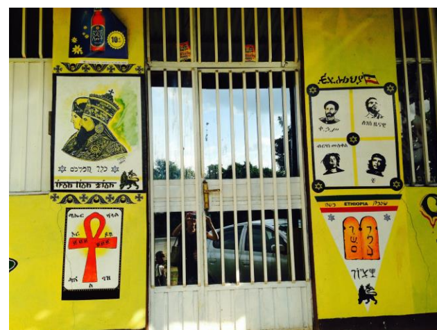
Front of a house (Shashemene, Ethiopia)