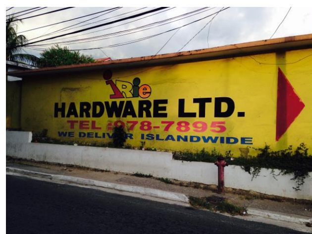
Irie Hardware: the commodification of Rasta language (Kingston, Jamaica)