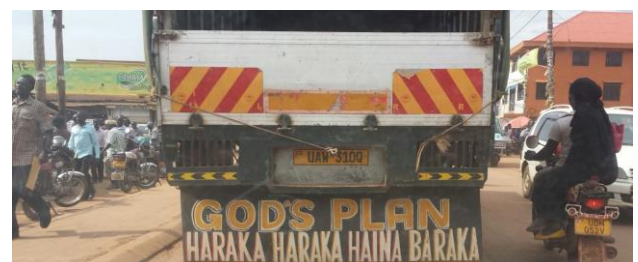
Fig. 4: Kiswahili proverb on a truck in a Kampala traffic jams

Kiswahili is also known for its use in orature in the form of proverbs, hadithi ('stories') and poems. Proverbs, particularly, have spread from the East African coast into the hinterland, and can be found on Ugandan (taxi)buses, motorbikes and trucks (see Fig. (4)). The widely known proverb haraka haraka haina baraka ('too much of a hurry does not bring blessings') is used as a polite warning to the following vehicle not to speed or tailgate. As has been pointed out before, Swahili is often perceived as a language of 'authority' and 'order'. In the example presented, the use of Swahili expresses both an idiomatic cross-reference to a hegemonic and standardized language from the East coast, and as an educative appeal to other road users.