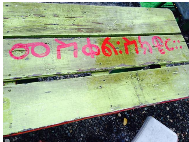
መስቀል ስኩዌር Mesk'el Square at the veggie meals on wheels restaurant (Kingston, Jamaica)

Rastafari is a global phenomenon with far-reaching networks and communities all over the world. It connects various places but in particular Jamaica and Ethiopia, bringing together different languages and establishing emblematic linguistic practices. Rastafari emerged in the 1930s in Jamaica and focuses on Ethiopia in African identity formations and as home in Repatriation discourses and practices. Ethiopia is host to a global Rastafari community in Shashemene, in which Jamaican Rastafari constitute a majority. The photos in this picture series were taken in Shashemene, Ethiopia (2014) and Kingston, Jamaica (2015) and give impressions of the linguistic landscapes which reflect local contexts and transnational connections. 3