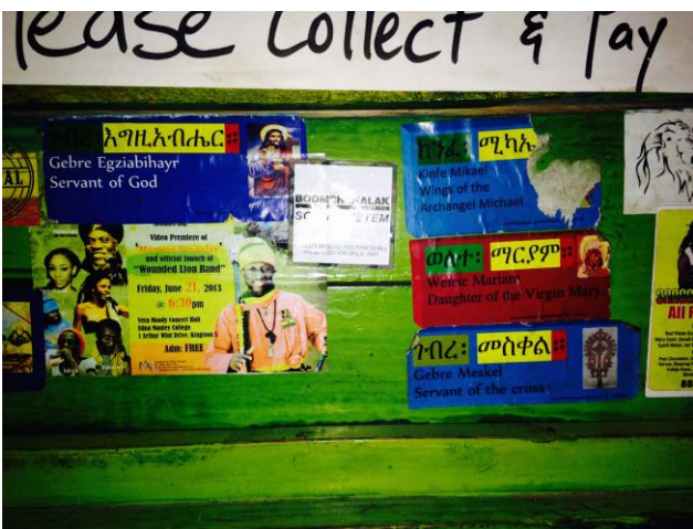
Wall at the veggie meals on wheels restaurant (Kingston, Jamaica)