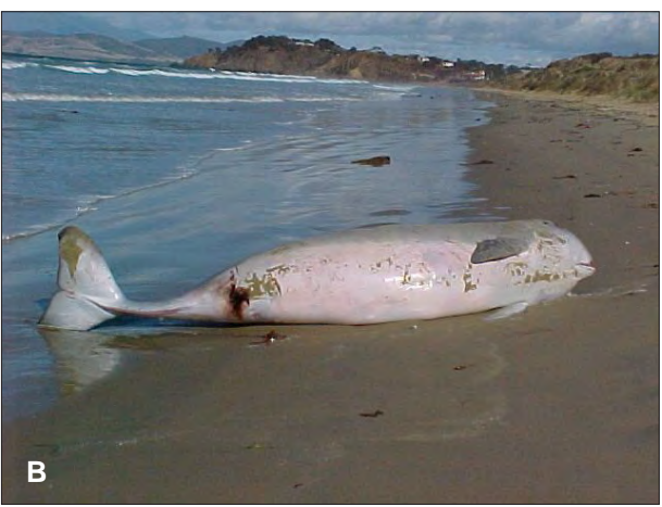
PLATE 1 A, B. Pygmy Sperm Whales that stranded on Carlton Beach, southeast Tasmania on 17 February 2003.

with an additional two historical museum records (table 1; fig. 1). All individuals were dead on discovery, except the individual found alive on Ocean Beach, which was apparently successfully returned to sea. Strandings have been primarily single adults, with two juveniles (male and female) recovered from Carlton Beach in 2003 (pl. 1). There are no records of calves stranding along the Tasmanian coast. No confirmed at-sea sightings of Pygmy Sperm Whales have been reported from Tasmanian waters.