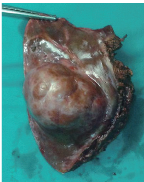
Figure 2 Resected tumor along with the segment II and III of liver.

and appendectomies are performed routinely and have outnumbered the open cholecystectomies and appendectomies that are done only in a narrow spectrum of indications. Apart from that the explorations, the ulcer perforation and hernia repair are performed laparoscopically, as well. During last 10 years the elective splenectomies and colon resections are performed laparoscopically in the high number of cases.