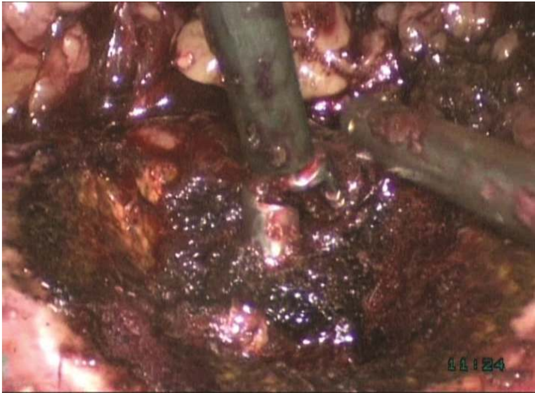
Figure 3. View of the transection bed.