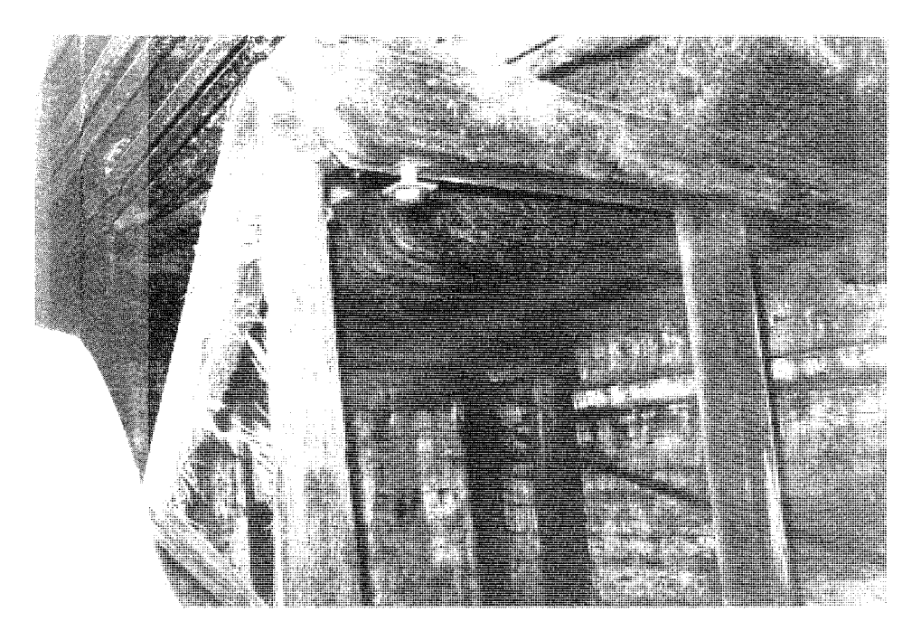
PLATE 4 Base of the brine tank visible in the ceiling of Room 5.

large iron tank which projected down from the floor above (pl. 4). This has been provisionally identified as a brine tank. Larger diameter pipes, insulated with wood-wool and some synthetic insulating material, ran the length of the building below the ceiling of Rooms 4 and 5.