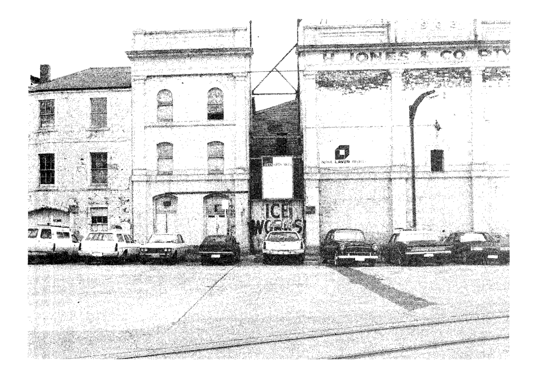
PLATE 1 The facade of the Old Iceworks.

with a condensation tower to liquefy the ammonia and thus recycle it; one is illustrated in the Mercury article cited above. These machines compressed the ammonia gas which was then pumped through 3.8 miles (20 000 ft) of piping in a condensation tower. Cold water, pumped from the River Derwent, was run over the pipes, cooling the ammonia to a liquid which was then recirculated. There were 22 refrigerating rooms at IXL, providing 450 000 cu. ft (12 750 m<sup>3</sup>) of space (The Mercury 28 January 1922: 11), far more than the seven insulated rooms which survived in the Old Iceworks building at 35 Hunter Street. The other cold-storage rooms, the switchroom and the compressors must have been located in 37 Hunter Street and other nearby Henry Jones properties. At this time there was a 3000 gallon brine tank, the capacity of which was only enough to keep one of the Linde compressors busy. Thirty tons of ice could be made in 24 hours but the actual output was much lower. In December 1921, 104 tons of ice were made. In 1931 it was claimed that most of the ice used in southern Tasmania was made here (Anon. 1931: 192).