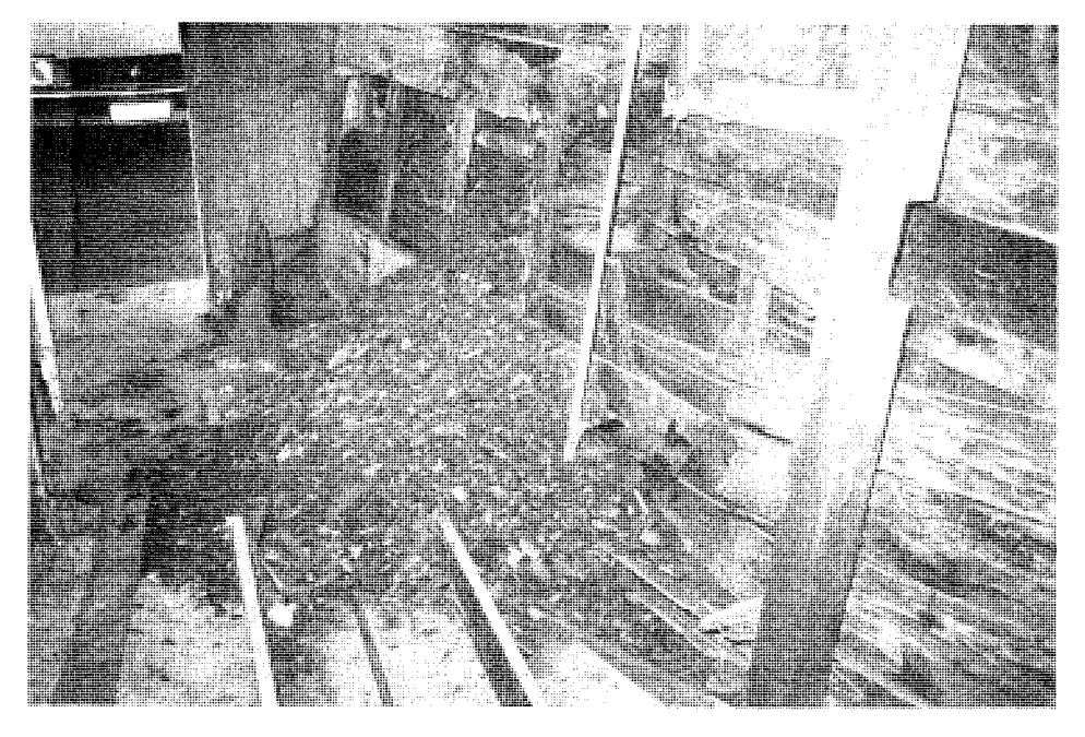
PLATE 2 Charcoal insulation in Room 1.