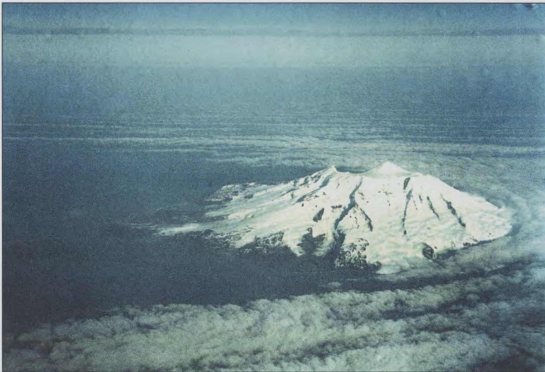
Aerial photograph of Heard Island — taken from the northeast.